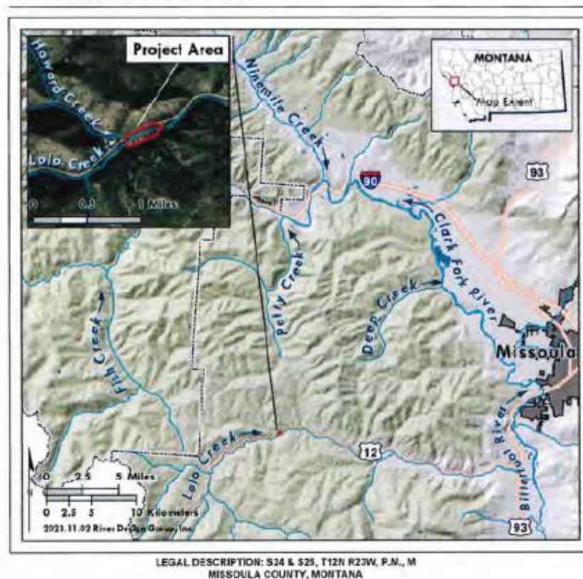
Figure 1. Location Overview