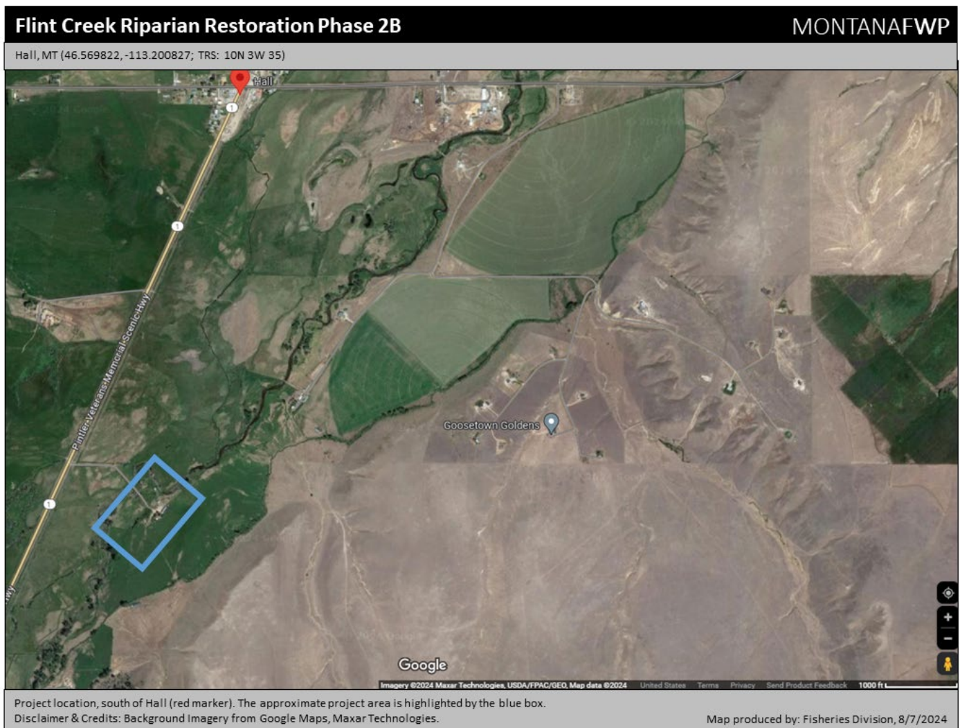
Figure 1. Project Location Map