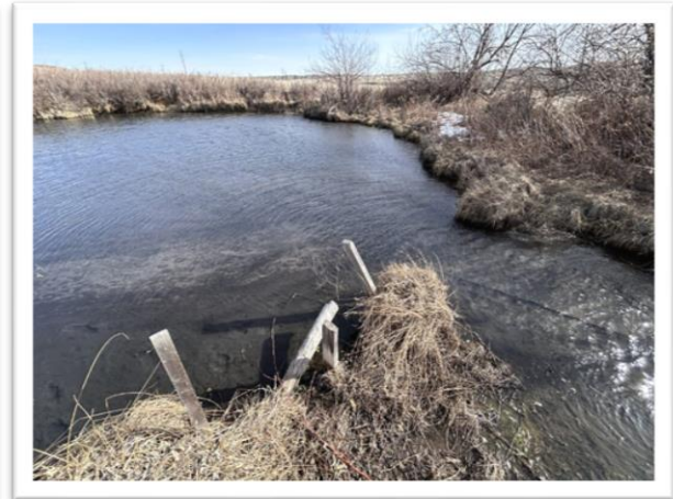
Figure 3 (above): Morony Pond outlet, North View