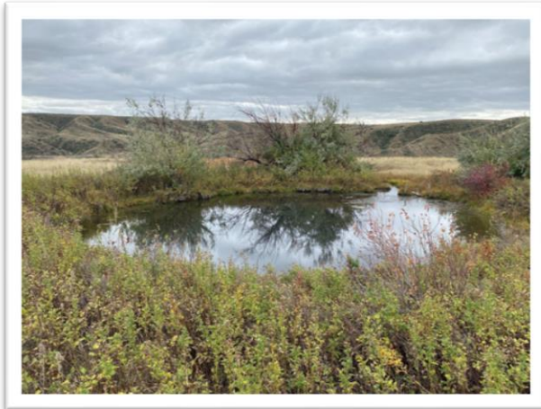
Figure 2 (above): Morony Pond, South View