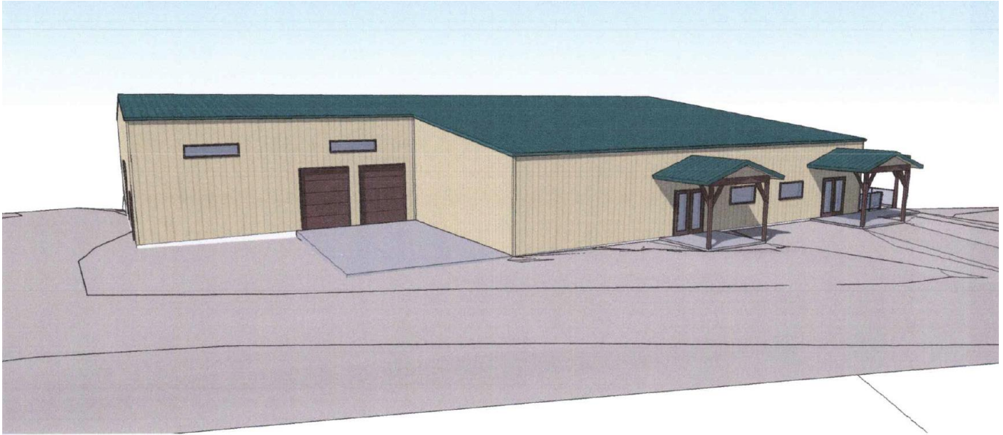
Figure 2. Rendering of Proposed Youth Shooting Sports Complex at Deer Creek Shooting Center, Missoula, Montana.