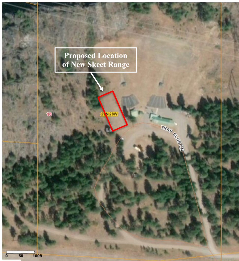
Figure 2. Thompson Falls Trap Club Proposed Project, Thompson Falls, Montana.

4. Agency Authority for the Proposed Action: MCA 87-1-276 through 87-1-279 (Legislative established policies and procedures for the establishment and improvement of shooting ranges) and MCA 87-2-105 (Departmental authority to expend funds to provide training in the safe handling and use of firearms and safe hunting practices). The Montana Legislature has authorized funding for the establishment of a Shooting Range Development Program providing financial assistance for the development of shooting ranges. Montana Fish, Wildlife & Parks (FWP) has responsibility for the administration of the program, including the necessary guidelines and procedures governing applications for funding assistance under the program.