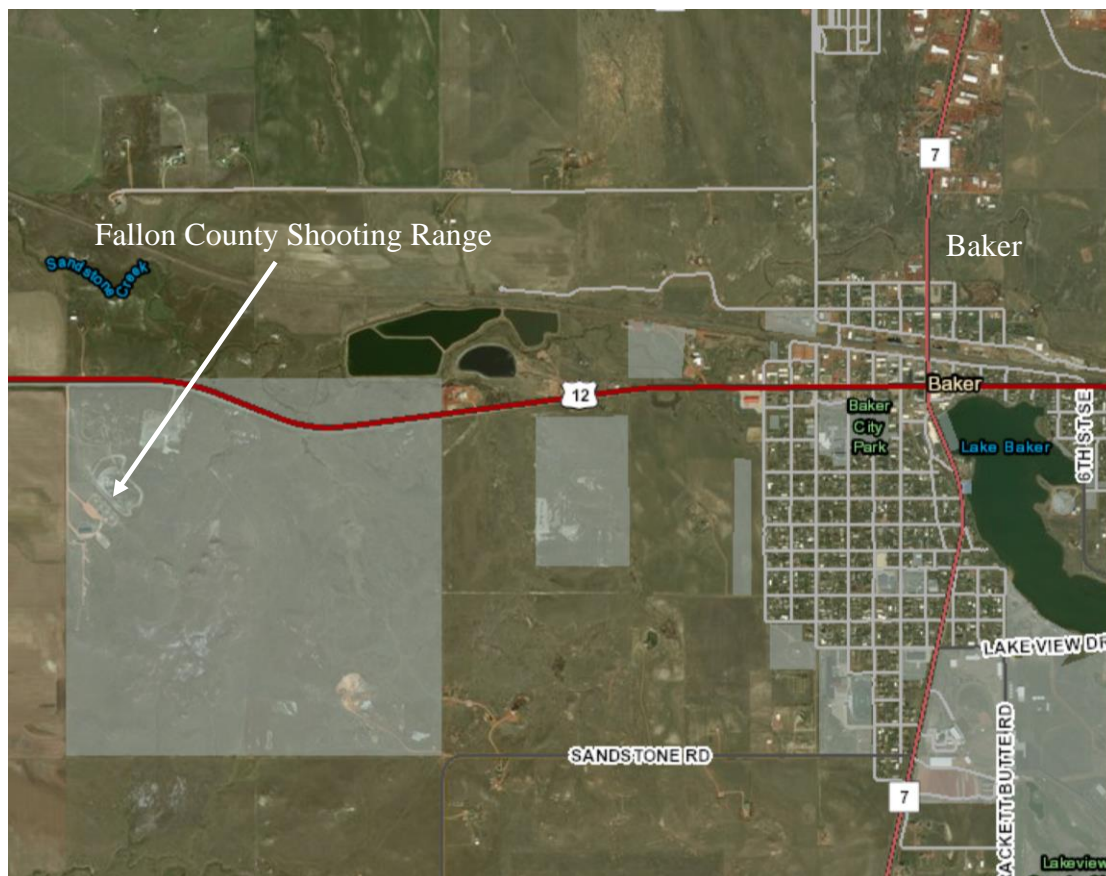
Figure 1. Fallon County Shooting Range, Baker, Montana.

The Fallon County Shooting Range is located on 47 acres 3 miles west of Baker, Montana at 8006 Highway 12, Baker, Montana, 59313; Section 15, Township 7 North, Range 59 East.