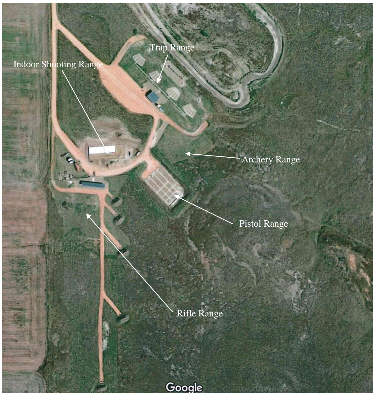
Figure 2. Overhead view of Fallon County Shooting Range, Baker, Montana.