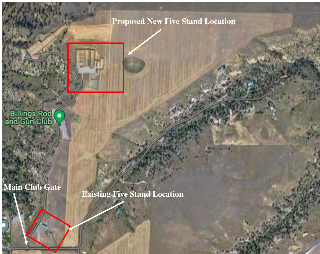
Figure 3. Large Scale Aerial View of BRGC's Proposed Project Location(s)