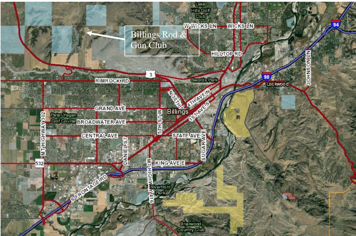
Figure 1. Location of Billings Rod and Gun Club Range (BRGC)