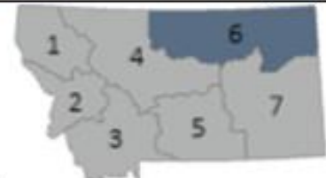
Figure 1 – Proposed panfish stocking locations in Blaine and Phillips Counties.

Date: 5/25/2023 FWP Region 6 Blaine and Phillips Counties