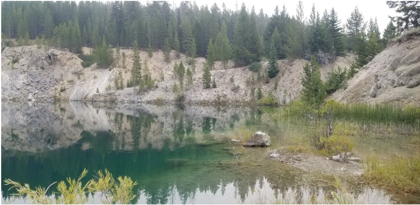
Figure 3. Calvert Mine Pond showing a shallow bay that is generally inaccessible to fish, thereby providing refuge for aquatic invertebrates. Western toads, which is a species of concern are also known to breed in this location.

An additional benefit of the proposed action is that two new WCT fisheries will be created. Catching a wild WCT in small stream in the Big Hole River drainage is rare because most streams are dominated by brook trout. Bryant Creek likely receives little fishing pressure because of its small size and the small size of trout. Studies, including some conducted in the Big Hole drainage, have shown that the abundance of most restored WCT populations are similar or greater than the former brook trout fishery. Further, maximum size of WCT is generally larger than brook trout in restored fisheries (Clancy et al. 2019; Olsen 2020; Feuerstein 2022). Due to the recent success of WCT restoration efforts in the Upper Missouri River, central district regulations have been changed from catch-and-release of WCT in streams and rivers to a 1 fish limit. The second fishery that will be created is the Calvert Mine Pond. It is anticipated WCT introduced into the mine pond would grow to 12-16 inches within 4 years of being introduced. The pond is readily accessible by vehicle and would provide an additional sport fishery to the area.