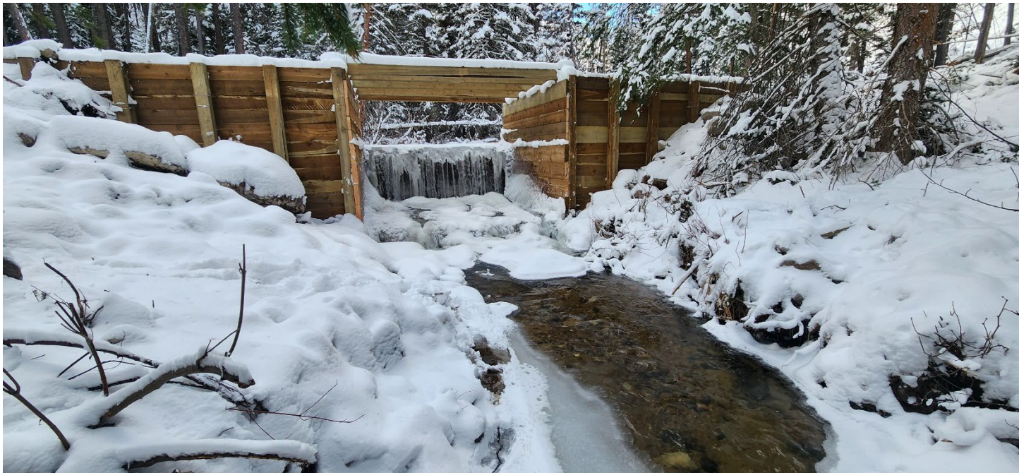
Figure 2. Fish barrier on Bryant Creek completed in the fall of 2022.

To prevent rotenone from traveling downstream of the proposed treatment area and affecting fish in lower Bryant Creek or the Big Hole River, potassium permanganate would be applied to the stream to neutralize rotenone at the fish barrier. Potassium permanganate is a strong oxidizer and quickly breaks down rotenone. (see Direct Impacts to Water Quality Section p 18 for more information). There is no risk to terrestrial wildlife and humans that come in contact with rotenone treated waters; however, per rotenone label requirements, public access to the Bryant Creek drainage will be restricted during the prescribed 2-4 day treatment period.