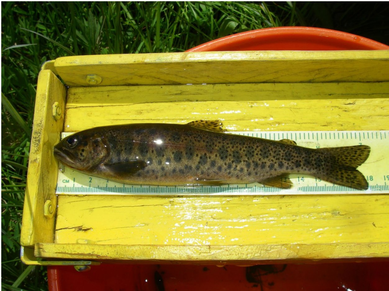
Figure 1. Westslope cutthroat trout from Bryant Creek in Trident Meadows.

Bryant Creek is a tributary to the Big Hole River upstream of East Bank Fishing Access site. The fishery of Bryant Creek consists of brook trout and an isolated remnant population of non-hybridized WCT in the headwaters of the stream. There is no record of brook trout stocking in Bryant Creek but stocking records in the late 19 th and early 20 th centuries are scant. The current brook trout fishery consists of roughly 200-400 fish per mile with an average size of 6 inches. Historically, WCT were the only trout species in Bryant Creek (Figure 1) but brook trout have displaced them except in the headwaters where a small, isolated population remains in 1.5 miles of habitat located within Trident Meadows. However, after fires in 2021 burned most of the drainage, brook trout were found in Trident Meadows. The presence of brook trout in the meadows and the habitat alterations resulting from the fire have put the Bryant Creek WCT population at high risk of rapid extirpation. Surveys conducted in the fall of 2023 suggest there may be as few as 50 WCT remaining in Bryant Creek.