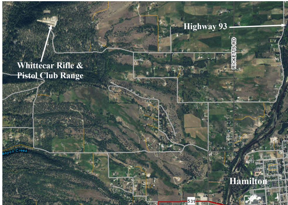
Figure 1 – Aerial View of the Whittecar Rifle and Pistol Range, Hamilton, Montana

The WRPR range is located approximately 3.5 miles northwest of Hamilton, Montana and 2.5 miles west of Highway 93 at 578 Blodgett View Drive, Hamilton, MT, 59840, Lat. 46.27415, Long. -114.198822; Section 15, Township 6 North, Range 21 West.