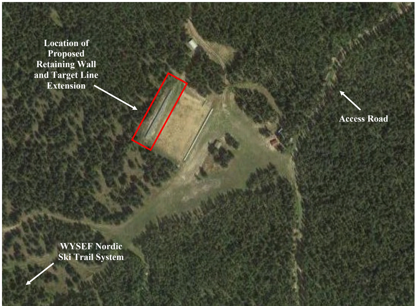
Figure 2. Project Map of WYSEF Biathlon Range, West Yellowstone, Montana

4. Agency Authority for the Proposed Action: MCA 87-1-276 through 87-1-279 (Legislative established policies and procedures for the establishment and improvement of shooting ranges) and MCA 87-2-105 (Departmental authority to expend funds to provide training in the safe handling and use of firearms and safe hunting practices). The Montana Legislature has authorized funding for the establishment of a Shooting Range Development Program providing financial assistance for the development of shooting ranges. Montana Fish, Wildlife & Parks (FWP) has responsibility for the administration of the program, including the necessary guidelines and procedures governing applications for funding assistance under the program.