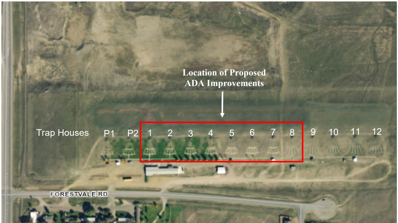
Figure 2. Location of Proposed Sidewalk and Lane Improvements

4. Agency Authority for the Proposed Action: MCA 87-1-276 through 87-1-279 (Legislative established policies and procedures for the establishment and improvement of shooting ranges) and MCA 87-2-105 (Departmental authority to expend funds to provide training in the safe handling and use of firearms and safe hunting practices). The Montana Legislature has authorized funding for the establishment of a Shooting Range Development Program providing financial assistance for the development of shooting ranges. Montana Fish, Wildlife & Parks (FWP) has responsibility for the administration of the program, including the necessary guidelines and procedures governing applications for funding assistance under the program.