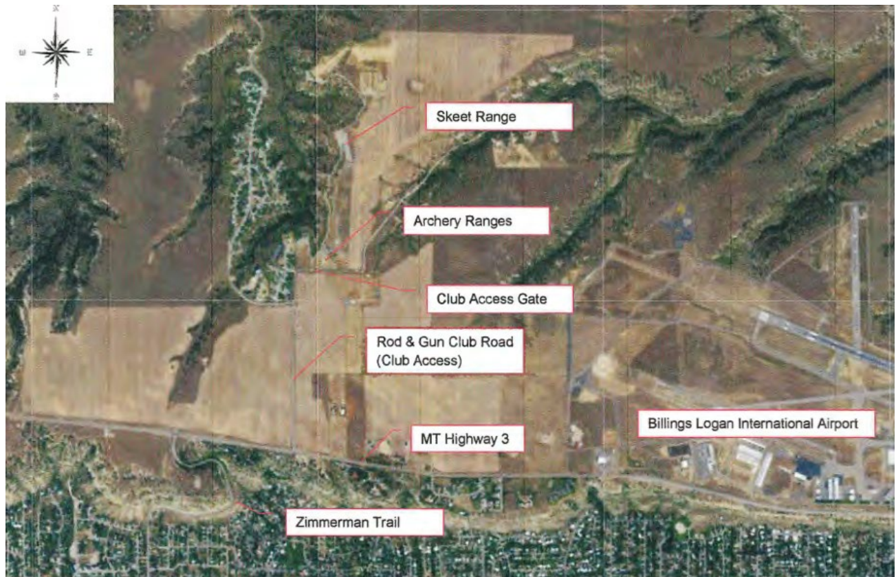
Figure 2. Aerial View of the BRGC, Billings, Montana