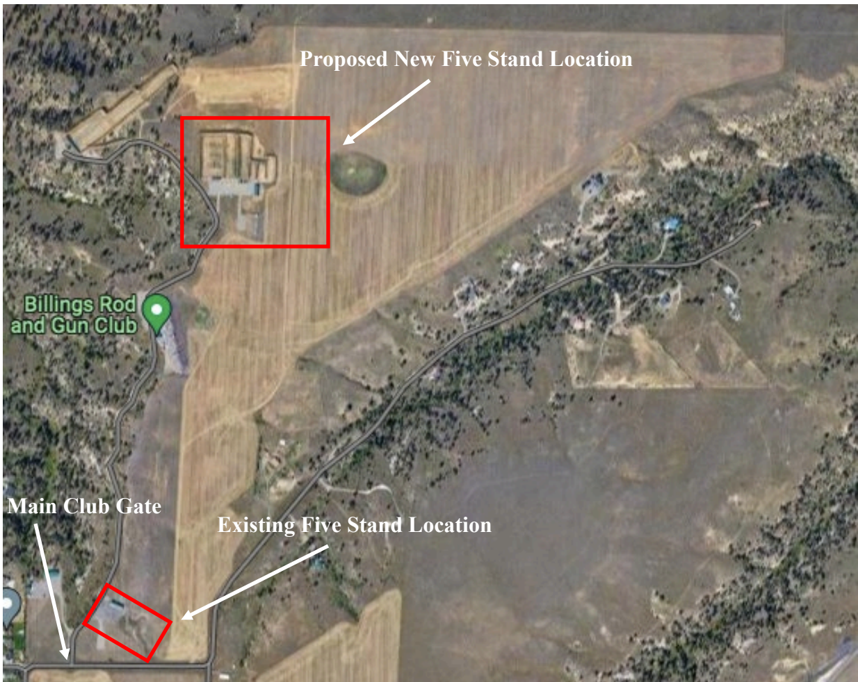
Figure 3. Large Scale Aerial View of BRGC's Proposed Project Location(s)