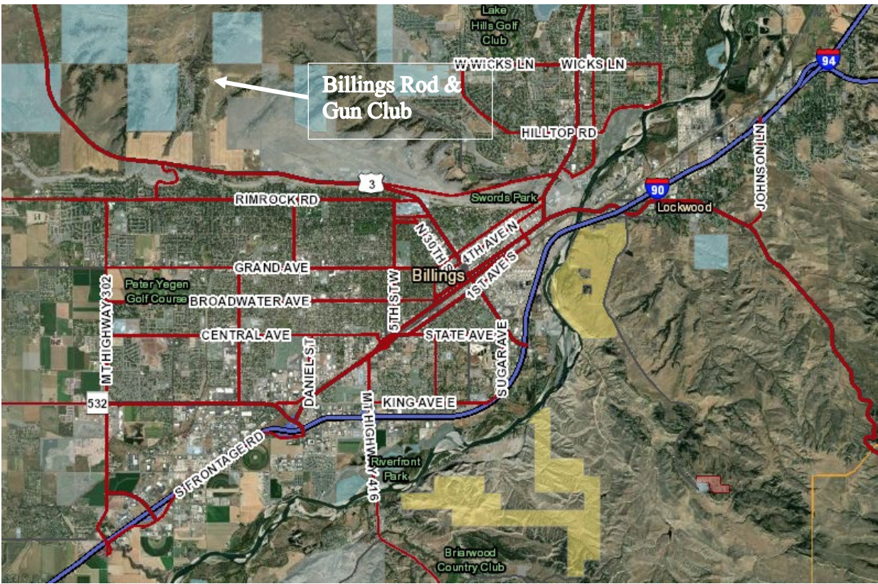
Figure 1. Location of Billings Rod and Gun Club Range (BRGC)