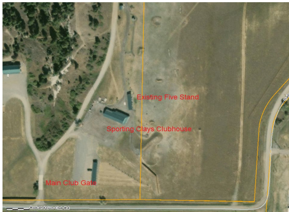
Figure 4. Location of Existing Five Stand (to be moved to new location) at BRGC