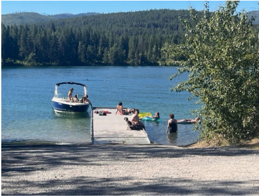
Figure 4. Photo of competing uses at the boat ramp