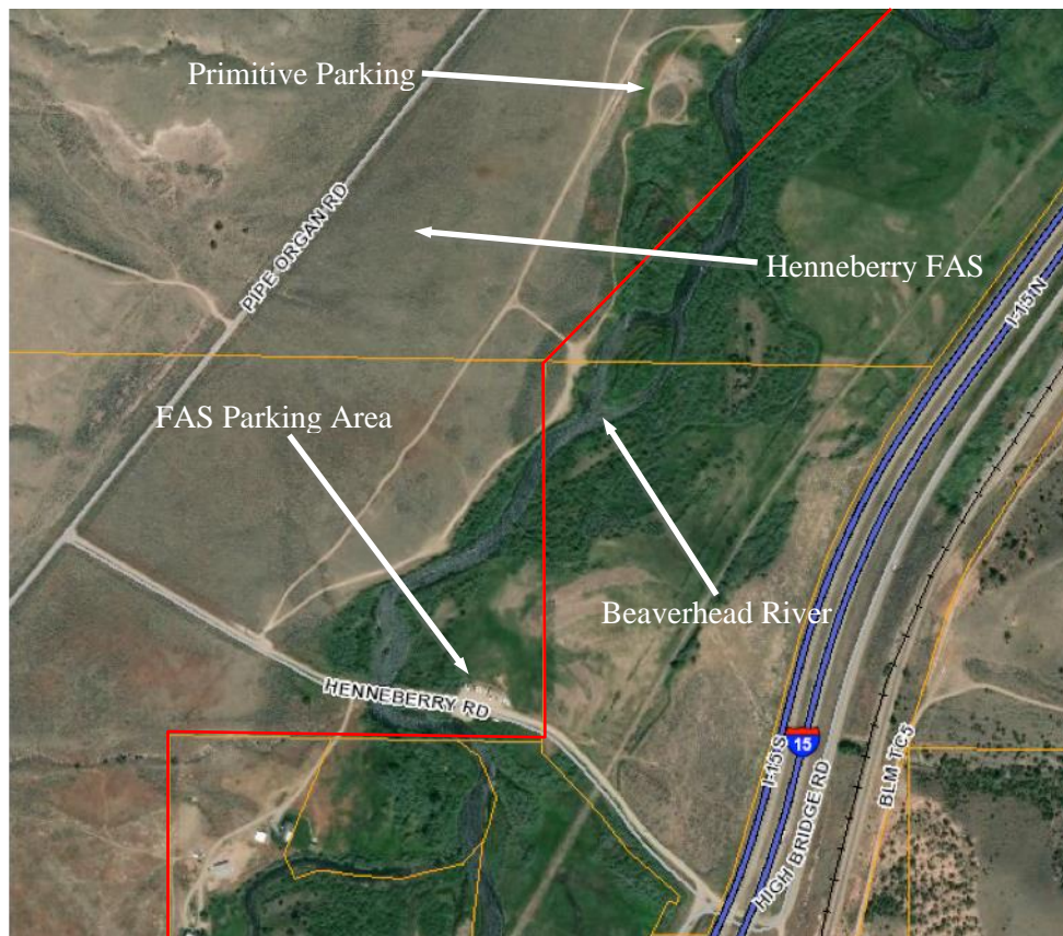
Figure 2 - Henneberry FAS and WMA Parcel Map, Dillon, Montana