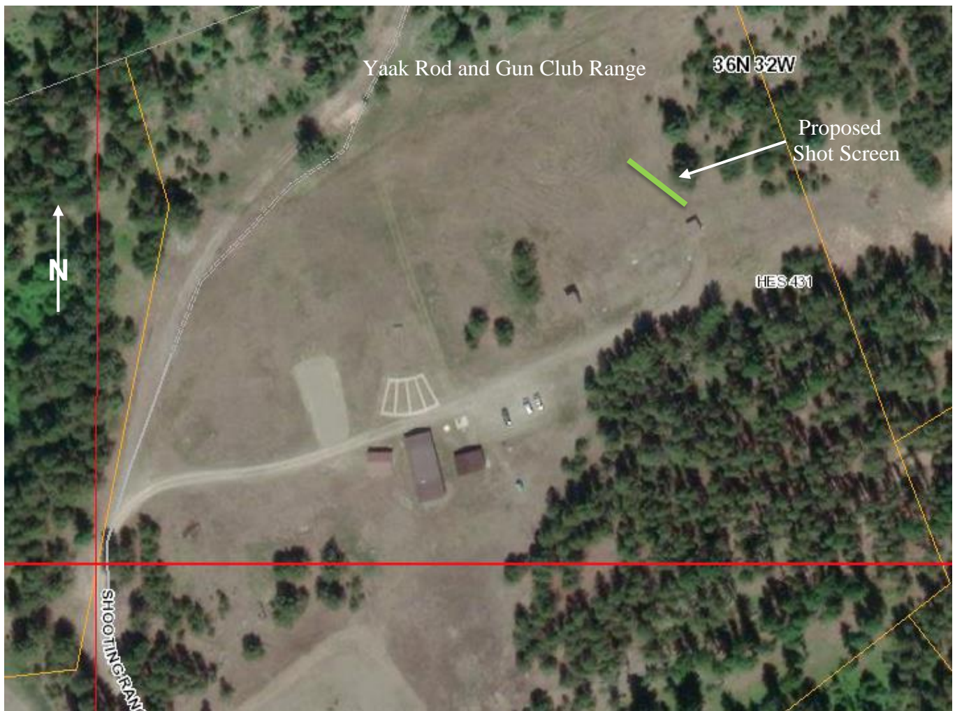
Figure 2 – Yaak Rod and Gun Club Proposed Project, Yaak, Montana.

4. Agency Authority for the Proposed Action: MCA 87-1-276 through 87-1-279 (Legislative established policies and procedures for the establishment and improvement of shooting ranges) and MCA 87-2-105 (Departmental authority to expend funds to provide training in the safe handling and use of firearms and safe hunting practices). The Montana Legislature has authorized funding for the establishment of a Shooting Range Development Program providing financial assistance for the development of shooting ranges. Montana Fish, Wildlife & Parks (FWP) has responsibility for the administration of the program, including the necessary guidelines and procedures governing applications for funding assistance under the program.