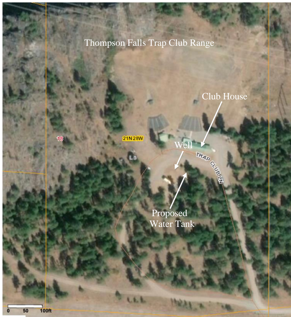
Figure 2 – Thompson Falls Trap Club Proposed Project, Thompson Falls, Montana.

4. Agency Authority for the Proposed Action: MCA 87-1-276 through 87-1-279 (Legislative established policies and procedures for the establishment and improvement of shooting ranges) and MCA 87-2-105 (Departmental authority to expend funds to provide training in the safe handling and use of firearms and safe hunting practices). The Montana Legislature has authorized funding for the establishment of a Shooting Range Development Program providing financial assistance for the development of shooting ranges. Montana Fish, Wildlife & Parks (FWP) has responsibility for the administration of the program, including the necessary guidelines and procedures governing applications for funding assistance under the program.