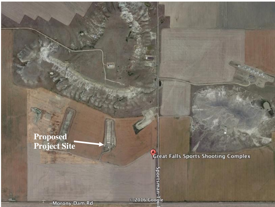
Figure 2– Aerial View of Great Falls Shooting Sports Complex, Great Falls, Montana.