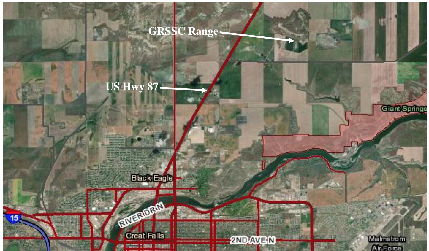
Figure 1. General Location of Great Falls Shooting Complex, Great Falls, Montana.

The GFSSC is located approximately 5 miles north of Great Falls, Montana, one mile east of Highway 87, at 171 Morony Dam Road, Great Falls, MT, 59405, Lat. 47.5730378, Long. 111.223764, Sections 15 and 16, Township 21 North, Range 4 East.