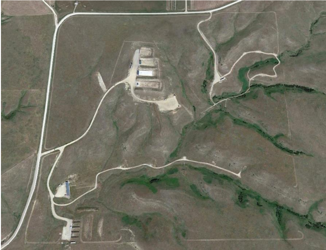
Figure 2 – Aerial View of Central Montana Shooting Complex, Lewistown, Montana

4. Agency Authority for the Proposed Action: MCA 87-1-276 through 87-1-279 (Legislative established policies and procedures for the establishment and improvement of shooting ranges) and MCA 87-2-105 (Departmental authority to expend funds to provide training in the safe handling and use of firearms and safe hunting practices). The Montana Legislature has authorized funding for the establishment of a Shooting Range Development Program providing financial assistance for the development of shooting ranges. Montana Fish, Wildlife & Parks (FWP) has responsibility for the administration of the program, including the necessary guidelines and procedures governing applications for funding assistance under the program.