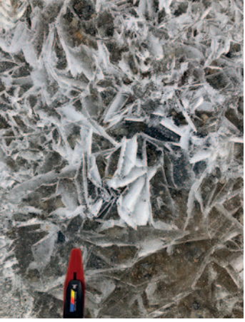
SMOOTH GLIDING Top: Skaters wearing Nordic skates skim across Canyon Ferry, Center: Ice formations. Right: A skater practices using ice claws. Worn around the neck, the studded dowels help a skater pull herself out of open water if she falls through thin ice