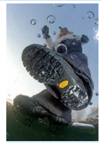
Approach with caution!

Early season ice in November and December is almost always the best for skating. New ice is denser, smoother, and more uniform, with fewer seams and ridges. But ice can also be dangerously thin that time of year, so be sure to check thickness before lacing up.