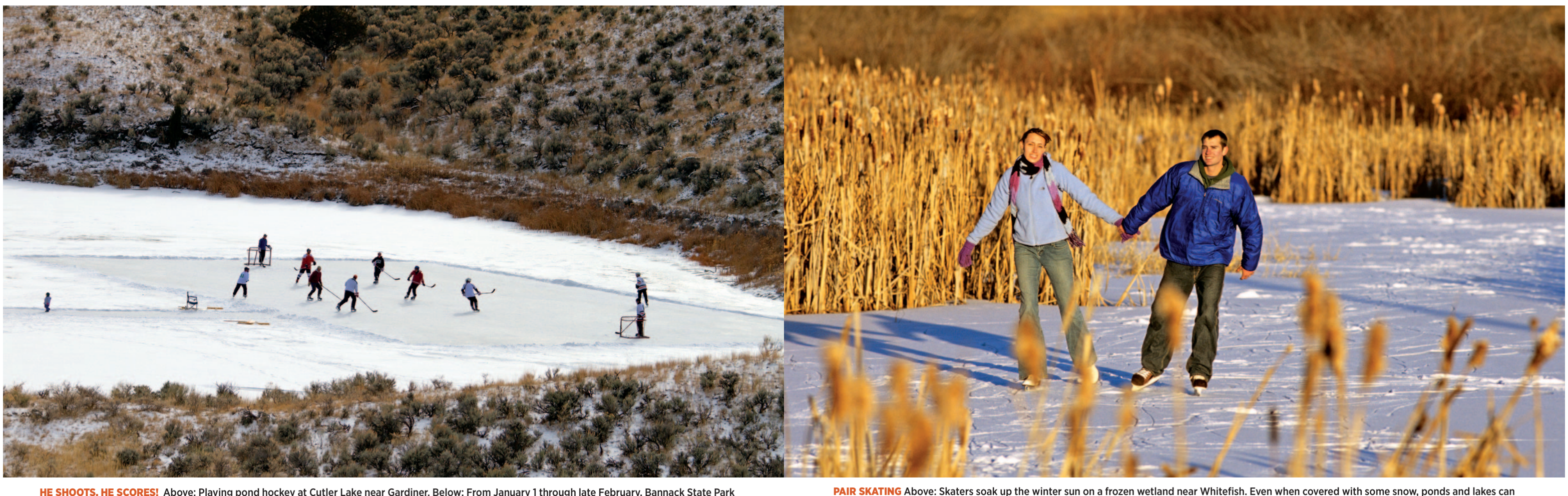
HE SHOOTS, HE SCORES! Above: Playing pond hockey at Cutler Lake near Gardiner. Below: From January 1 through late February, Bannack State Park offers skate rental, semi-groomed pond skating, a rinkside fire for roasting marshmallows, and hot chocolate, coffee, and cider in the warming house.

welcomed us along and showed us various hazards we needed to avoid. That's the great thing about the ice-skating community: Everywhere you go you'll find wonderful people eager to coach beginners, watch out for each other's safety, and have fun together on the ice.