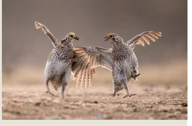
BRING IT ON The male sharp-tailed grouse's mating ritual is one of the great wildlife spectacles of the Great Plains. Vying for the attention of females, the males stomp, flutter, and pirouette at dawn, day after day.

Newcomers should follow certain guidelines to avoid disrupting the mating process and harming the local grouse population. Arrive early, since birds are skittish in daylight. A lightweight portable blind will allow close observation and photographic opportunities. Or park no closer than 100 yards away and view from your vehicle. Never allow dogs to chase birds at or near a lek.