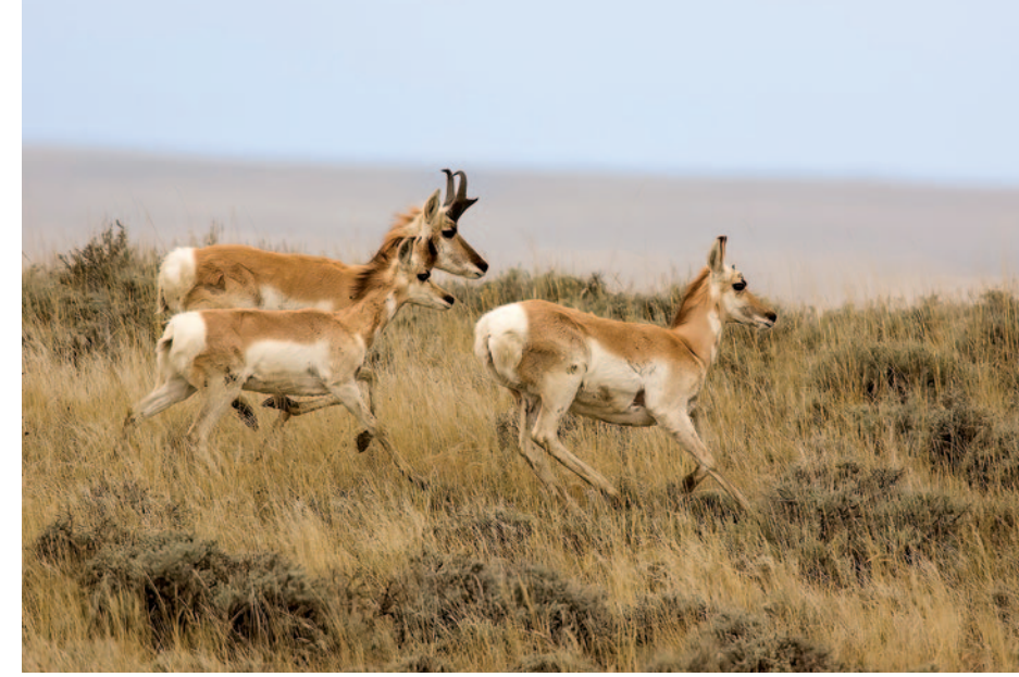
MOVING RIGHT ALONG Top: Partially electrified woven-wire fencing on the CSKT Bison Range on the Flathead Reservation is elevated to allow passage of pronghorn and other wildlife while containing buffalo. Above: A buck, doe, and fawn run freely across central Montana rangeland.

"Montana can't manage its pronghorn populations effectively without strong scientific data," Gude says. "Otherwise it's just a guessing game. This study is helping us remove as much of the guesswork from management decisions as we possibly can."