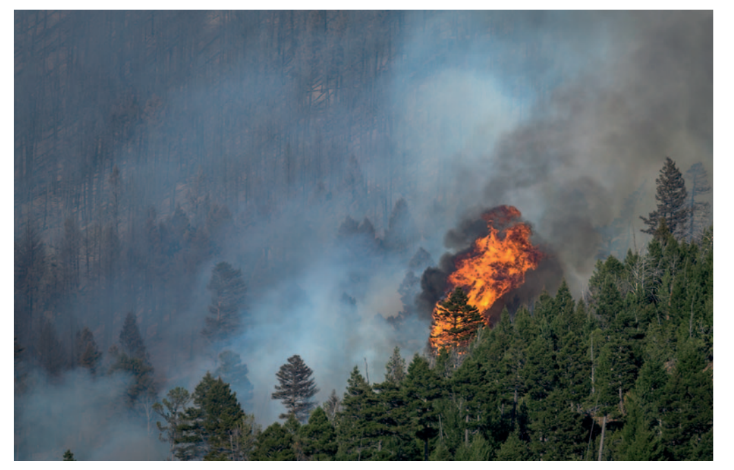
CHALLENGING YET ESSENTIAL TOOL Prescribed fires can burn back conifers taking over mountain meadows. But western forests have become so dry from record heat that controlled burns can escape their boundaries and threaten housing and other human development.

Mountain elk historically winter in lowelevation valleys. In spring they head uphill, sometimes traveling more than 100 miles. Then in early winter, deep snow drives them back downhill again. And so the cycle goes, generation after generation.