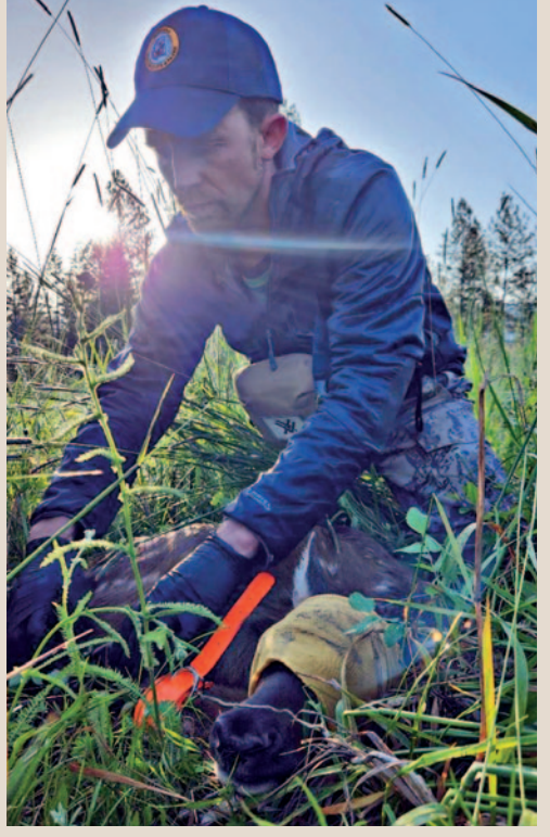
elk in HD 121 near Noxon as part of the FWP study to learn what factors most affect calf survival.

"We're hoping to better understand elk population dynamics in northwestern Montana by studying top-down influences like predation and bottom-up influences like habitat," Proffitt says. ■