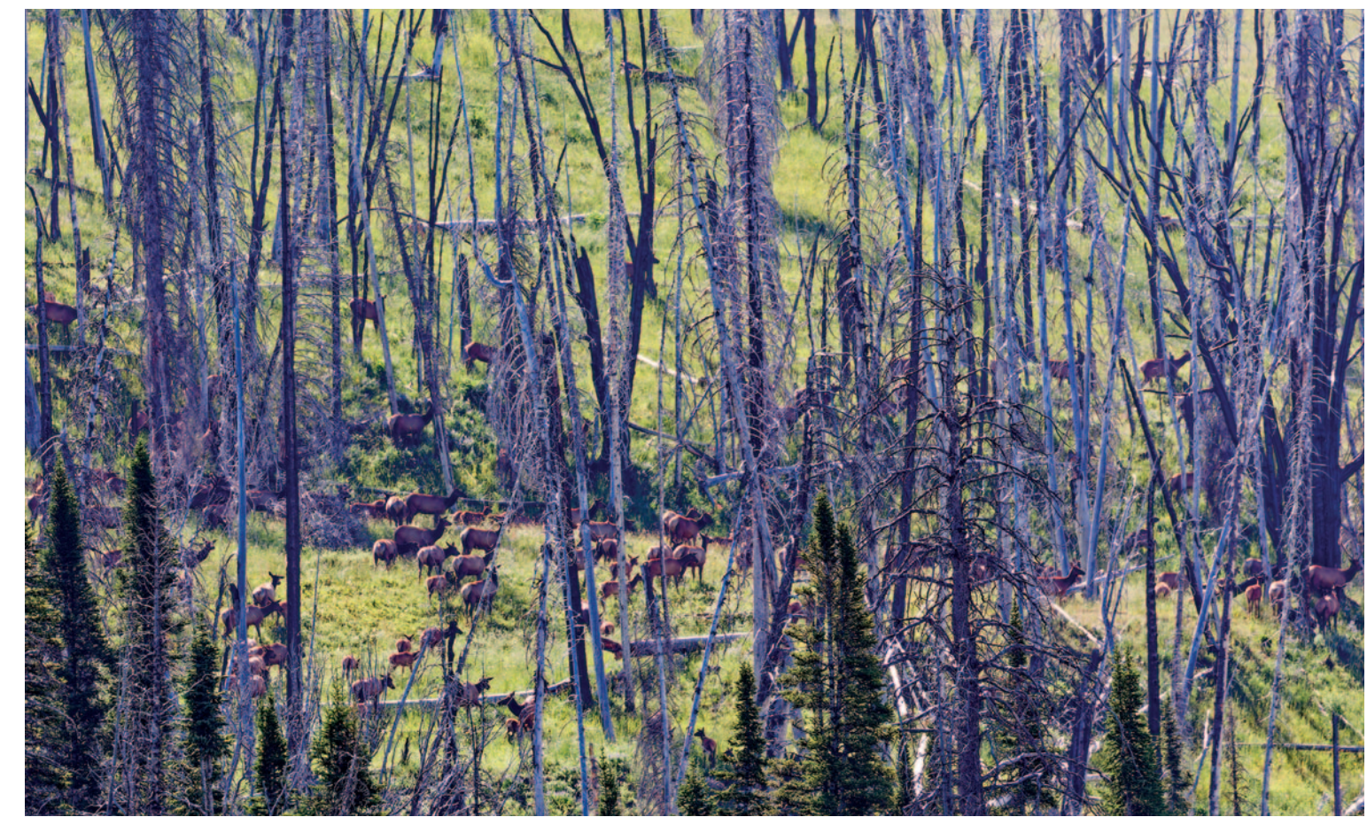
SUMMERTIME SWITCH Historically, mountain elk spent summer and fall in lush, nutrition-rich high-country meadows (above) kept open to sunlight by periodic wildfires and also, in the first half of the 20th century, clear-cut logging. But in recent years, as high elevations dry up and more landowners install irrigation pivots in low-elevation cropland, many herds have moved downhill to private valley pastures—and stay there year-round (below). This puts them beyond the reach of public-land hunters and creates crop depredation and fence damage on valley ranches.

But public-land logging operations have declined almost as precipitously as western Montana's elk population. According to the Montana Bureau of Business and Economic Research, timber harvest in national forests during the 2010s was just one-third that of the 1980s and '90s. Depending on who you ask, the cause ranges from federal environmental and endangered species regulations to competition from Canada. Meanwhile, almost all wildfires are suppressed lest they turn into uncontrollable infernos that burn through entire mountain ranges and threaten the growing number