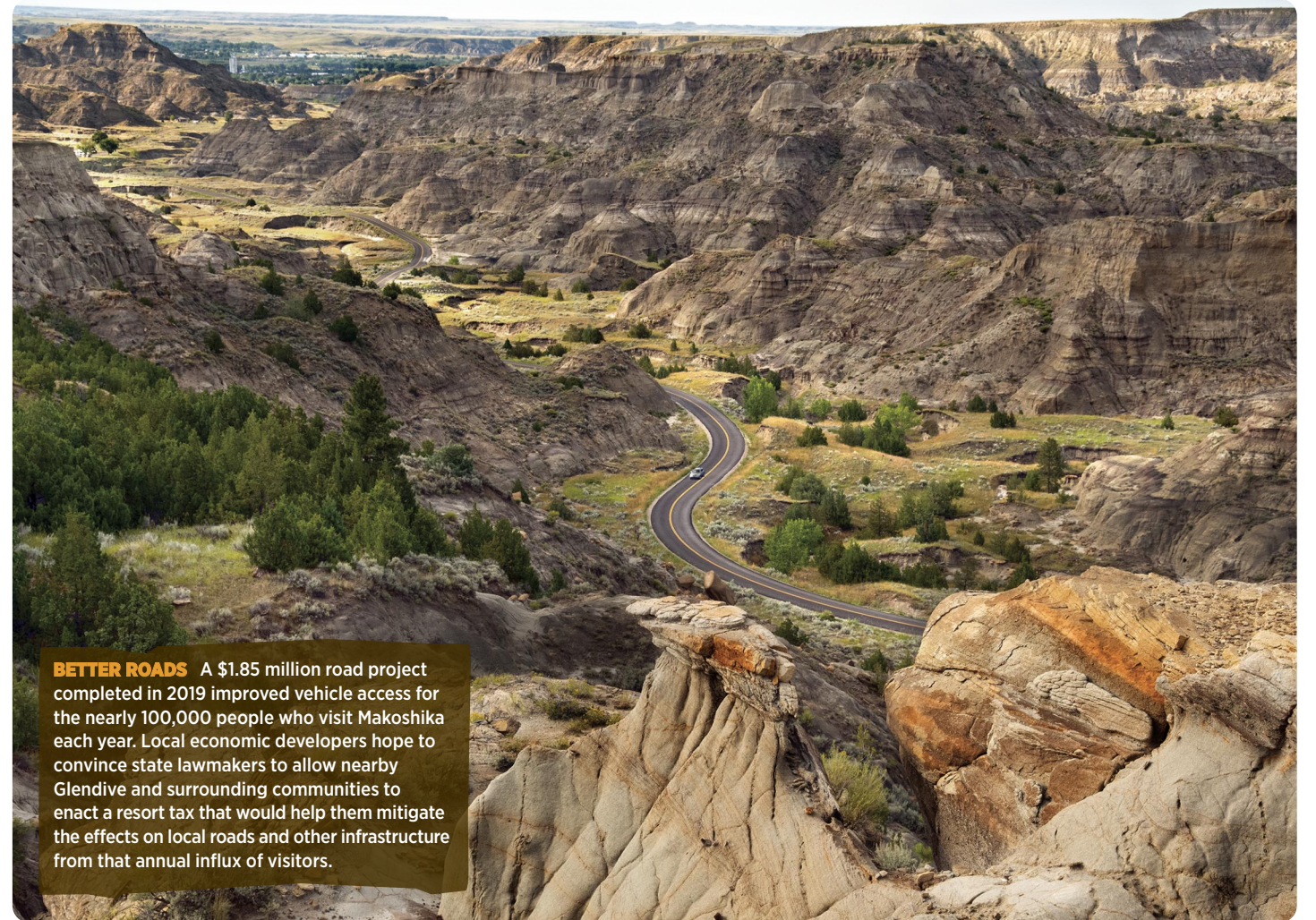
BETTER ROADS A $1.85 million road project completed in 2019 improved vehicle access for the nearly 100,000 people who visit Makoshika each year. Local economic developers hope to convince state lawmakers to allow nearby Glendive and surrounding communities to enact a resort tax that would help them mitigate the effects on local roads and other infrastructure from that annual influx of visitors.