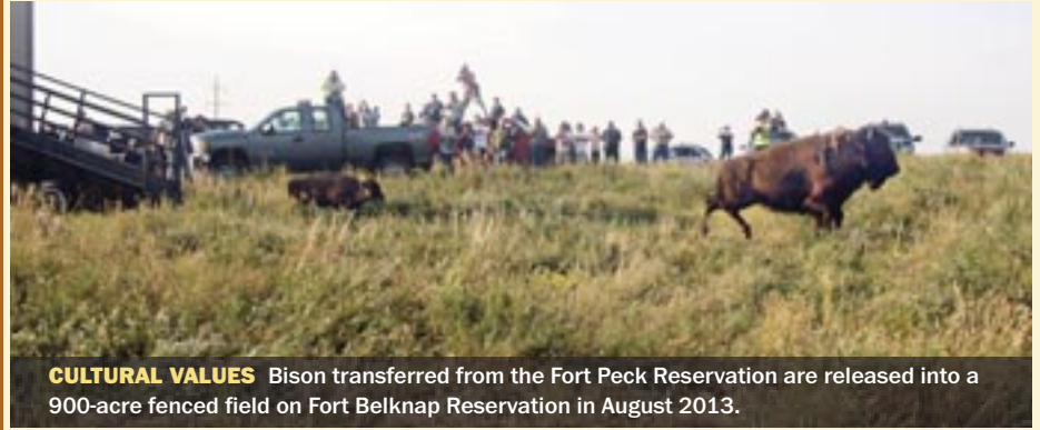
CULTURAL VALUES Bison transferred from the Fort Peck Reservation are released into a 900-acre fenced field on Fort Belknap Reservation in August 2013.

► Yellowstone bison: Bison that migrate into Montana from YNP are managed by three federal and two Montana agencies (FWP and the Department of Livestock) under a court-ordered agreement. Under a management plan, the state agencies are considering allowing bison some degree of movement outside the park's west and north boundaries. On the west side, the proposal could allow bison to range from the Hebgen Basin to as far north as the Taylor Fork drainage, but not into the Gallatin