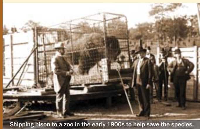
Shipping bison to a zoo in the early 1900s to help save the species.

But what excites conservationists, and troubles ranchers, is that the CMR represents a foothold on the plains that could enable bison to be returned to a wider landscape, one occupied mainly by cattle. Much of the prairie north of the CMR all the way to the Canadian border—an area nearly the size of Indiana—is managed by the BLM, whose principal function is to award permits allowing ranchers to graze cattle on public lands. Many conservationists are urging the