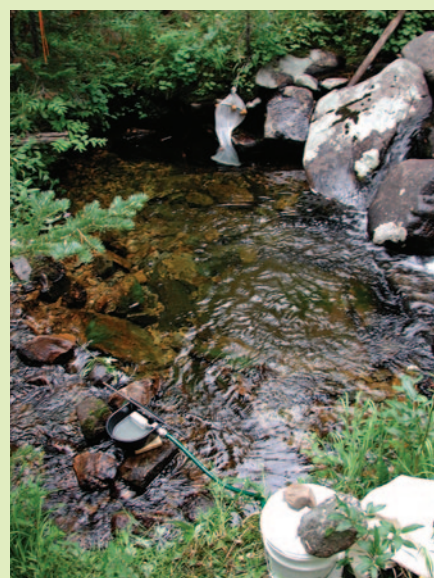
NATURAL NURSERY Left: To restore Cherry Creek, FWP first applied rotenone at drip stations (in white bucket through green hose). The piscicide was used to kill all existing trout, which were not native to the watershed. “Sentinel” fish (in net bag) were used to test the effectiveness of rotenone drip stations farther upstream.