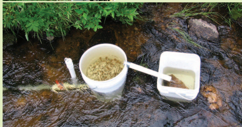
Below: FWP fisheries workers collected eggs from wild westslope cutthroat in small streams elsewhere in southwestern Montana. The eggs were incubated at a private hatchery on the Sun Ranch south of Ennis for several weeks until reaching the “eyed” stage. Fisheries workers placed the eyed eggs in remote streamside incubators (round white bucket) on Cherry Creek and its tributaries, where they hatched into fry and swam into the streams. “This method allows the developing eggs to imprint on the chemical composition of the water just as if they had been laid there naturally,” says FWP fisheries biologist Pat Clancey.