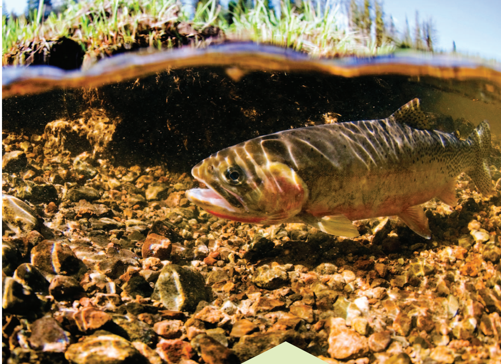
WESTSLOPE CUTTHROAT TROUT