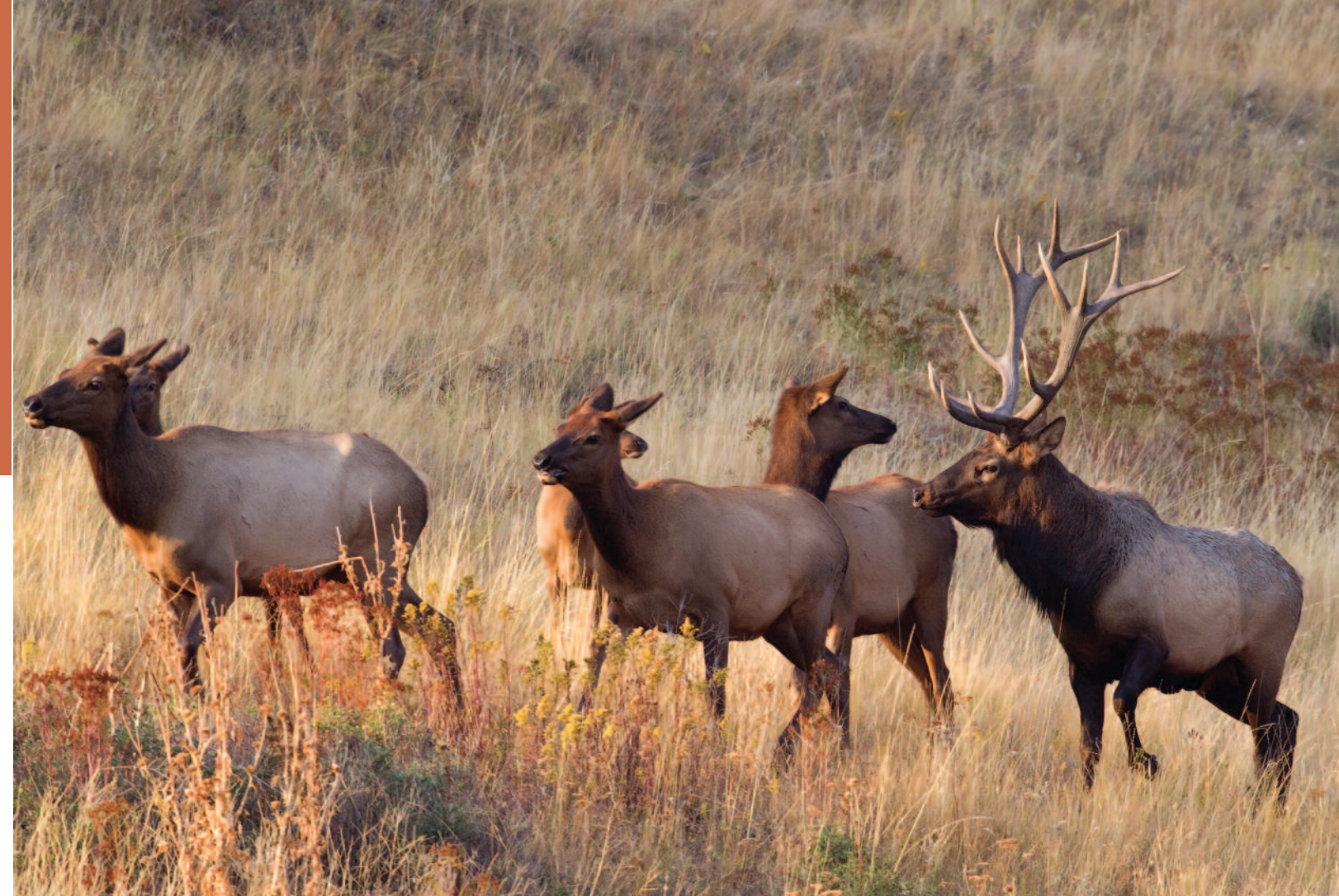
DIFFERENT LANDOWNER ATTITUDES Another issue in the Breaks region is that some ranchers suffer depredation on their property from elk, which can damage fences and eat forage meant for livestock. To bring numbers down, FWP generally increases the cow elk harvest by public hunters. But as Breaks elk were pushed onto private land that allowed no public hunting, that management tool became increasingly less effective.

The new regulations ended the days of virtually guaranteed permits in an area filled with trophy bulls. The rules are also why the number of nonresident hunters has fallen so sharply. Nowadays, out-of-state archers must go through two drawings to hunt elk with a bow in the Breaks: The first lottery is to obtain a general elk license, which lets them hunt in the state. The second is to receive an archery permit in the Breaks. Since 2008, nonresidents have been limited to up to 10 percent of the number of total archery permits.