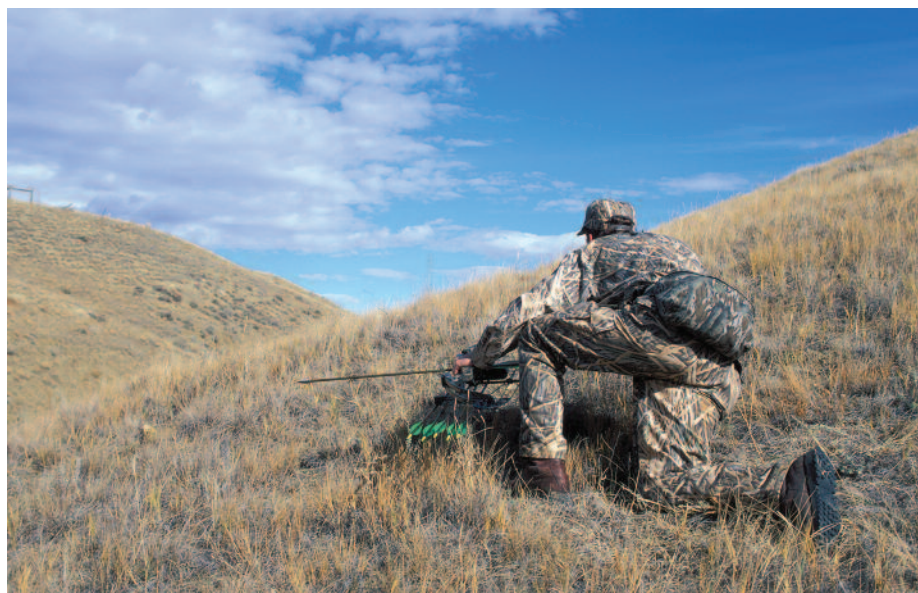
TOO MUCH OF A GOOD THING As the popularity of the Breaks' archery hunt grew, so did complaints by residents of overcrowded conditions and hunters pushing elk off public land onto private property.