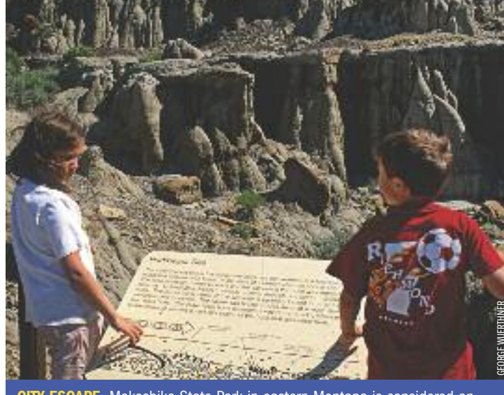
park because it is partly within the Glendive city limits. Local families visit to learn about geology and dinosaurs, have a picnic, or take a bike ride on the park's quiet paved roads.

In Montana, it's not always obvious what is or isn't an urban state park. For instance, Makoshika State Park might seem to be in the middle of nowhere, yet its visitor center is