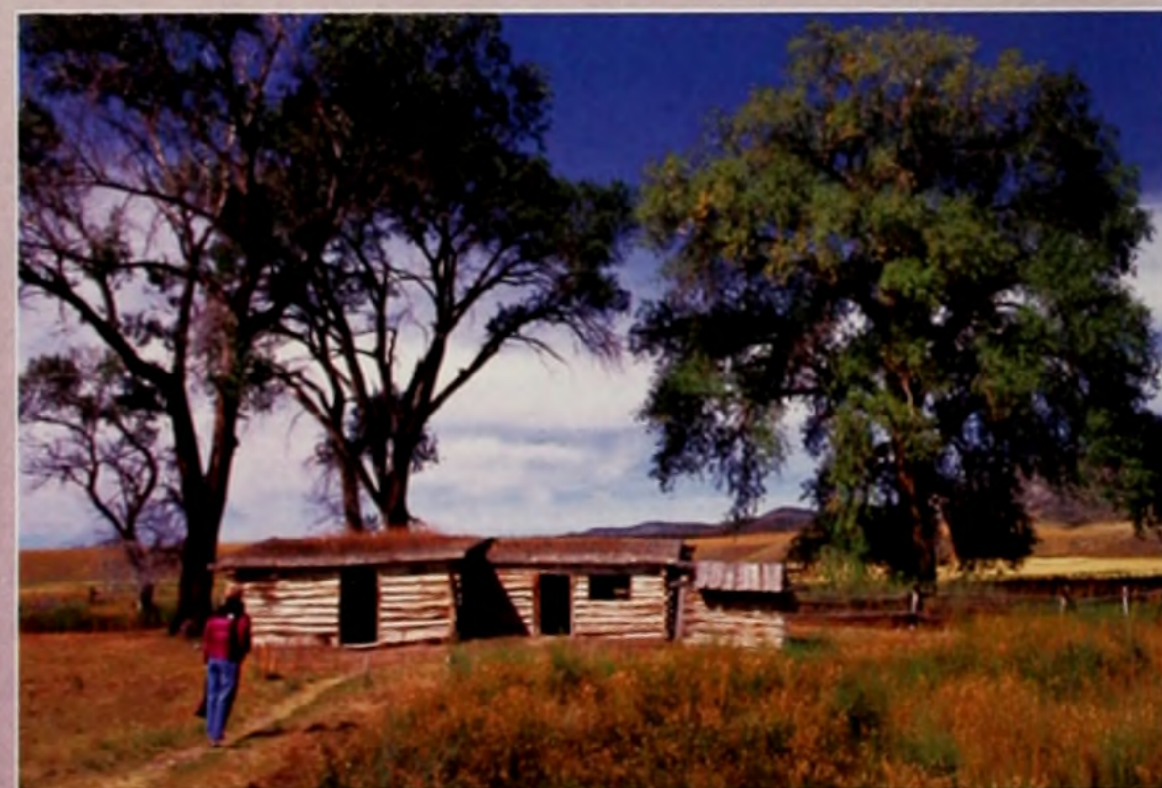
Below: A visitor walks to the old log cabin at tiny Parker Homestead State Park. JEFF ERICKSON