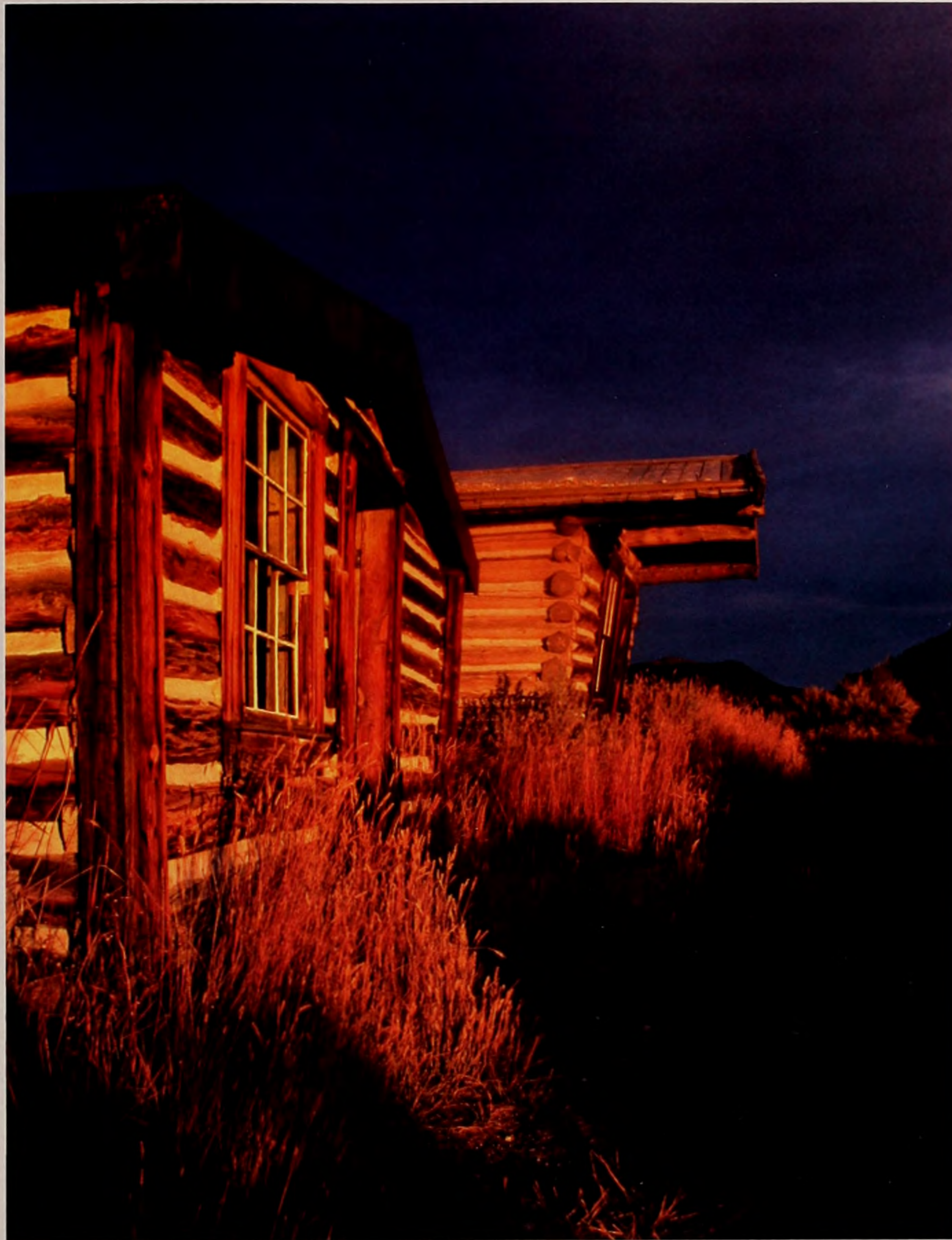
Above: Late afternoon light warms historic buildings at Bannack State Park, the site of Montana's first territorial capital.