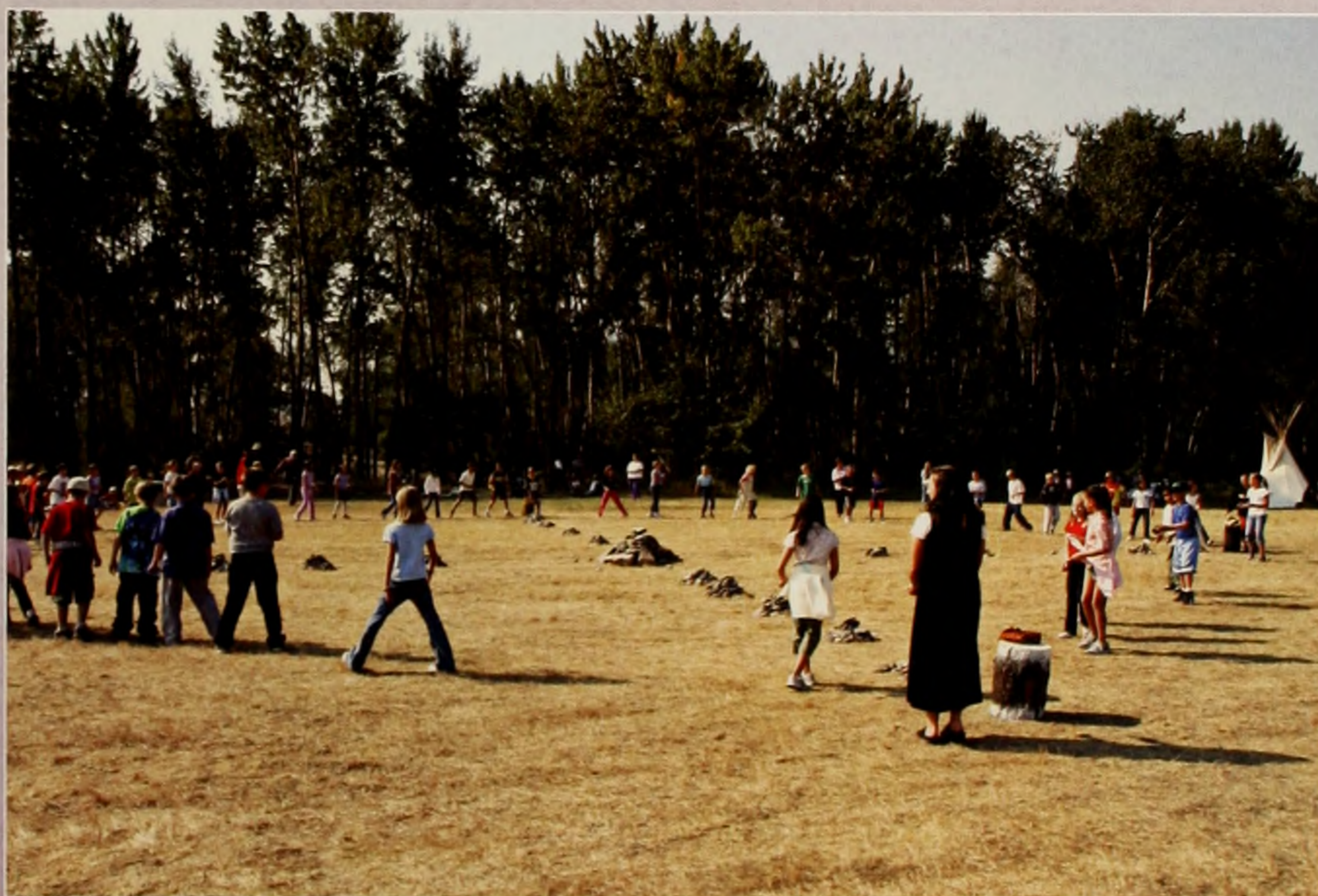
Left: Games help students learn the significance of historic routes like the Old North Trail, Road to the Buffalo Trail, and Nez Perce Trail, which pass through the Travelers' Rest State Park area. NORMAN JACOBSON