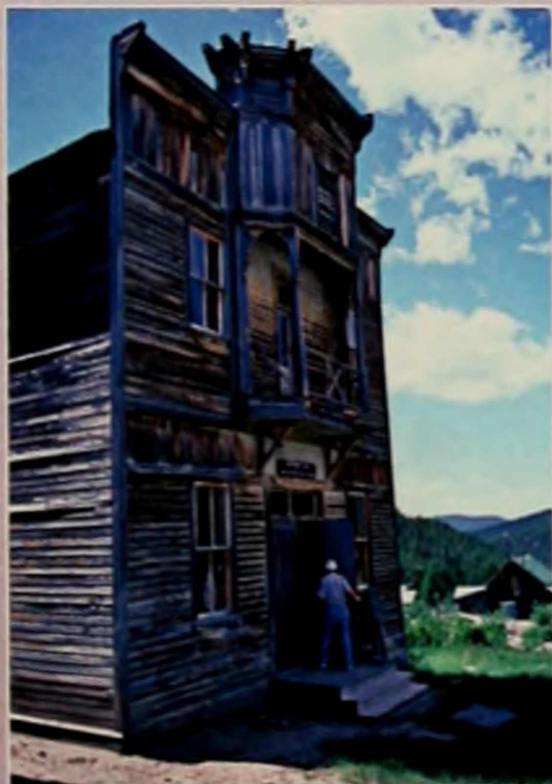
Left: Stately Fraternity Hall at the Elkhorn State Park ghost town shows the pride early settlers took in their public buildings.