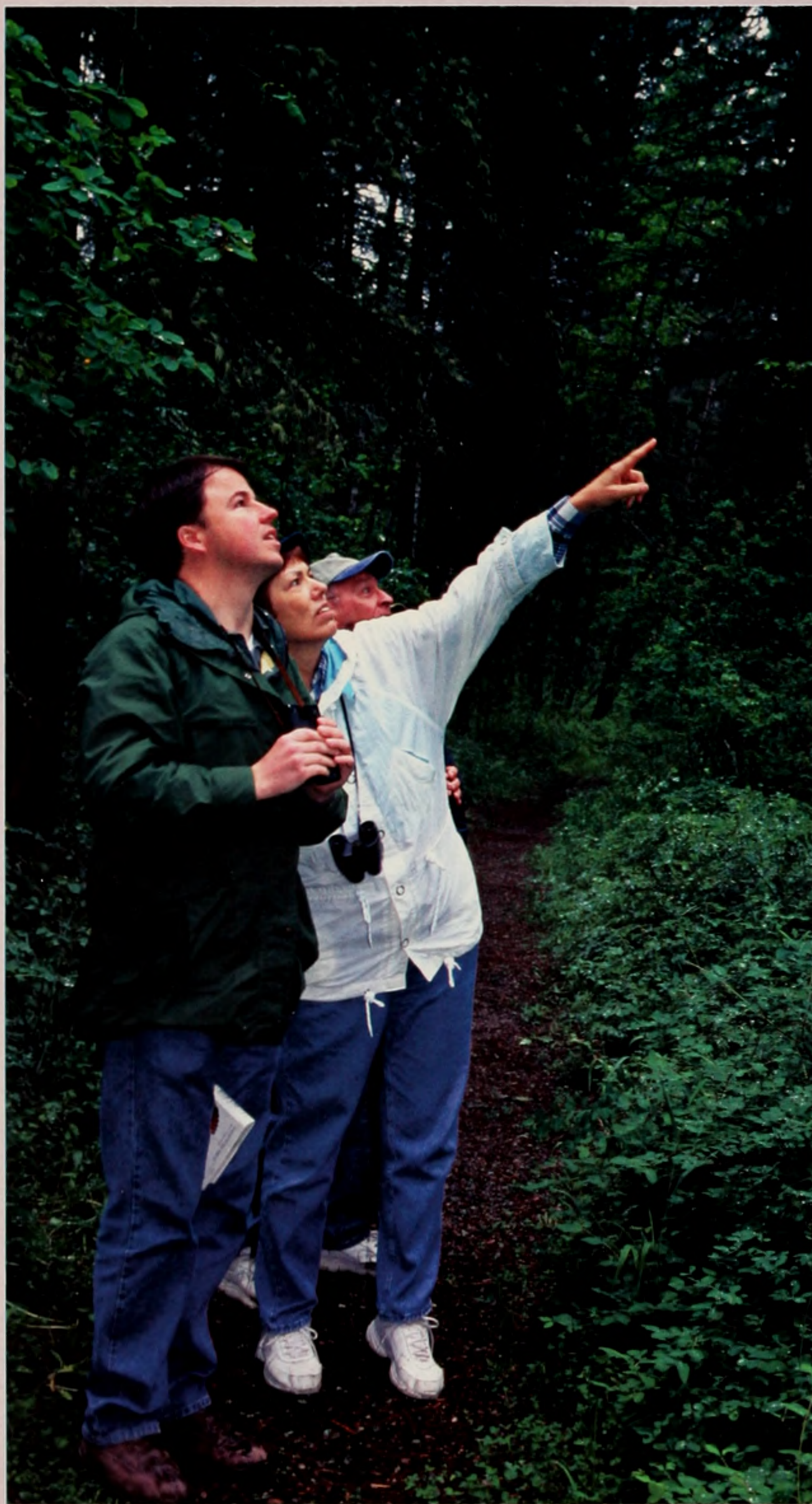
Above: Warblers, woodpeckers, and other birds abound at the Wayfarers unit of Flathead Lake State Park. CRAIG & LIZ LARCOM