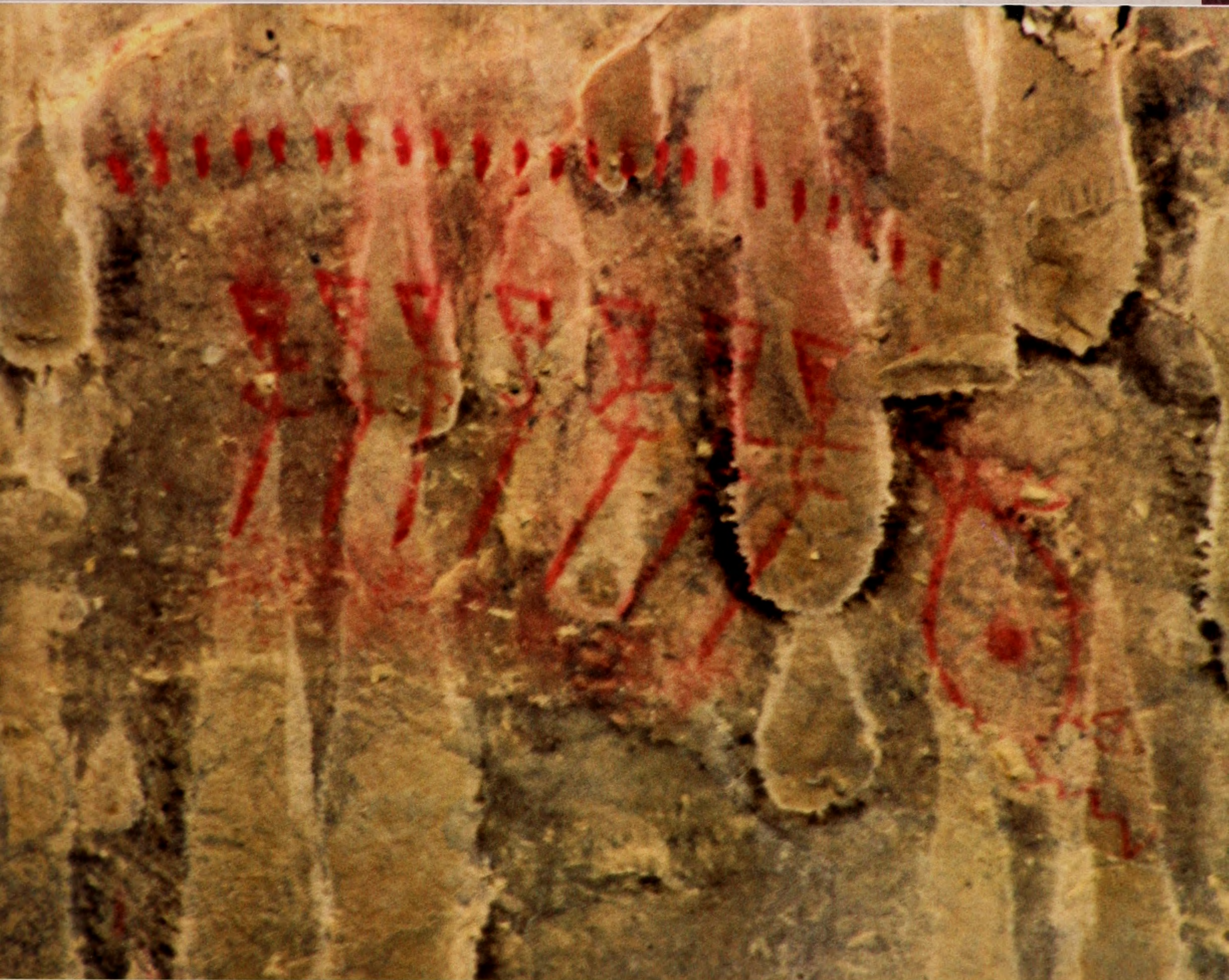
Above: Prehistoric paintings dating back 2,000 years depict hunting scenes at Pictograph Cave State Park. PHIL FARNES