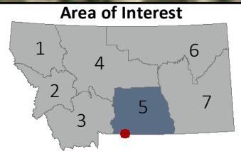
Area of Interest

Elevation: 9741 Feet Area: 9 Acres Max Depth: 47 Feet Volume: 195 Acre-Feet Ave Depth: 20 Feet