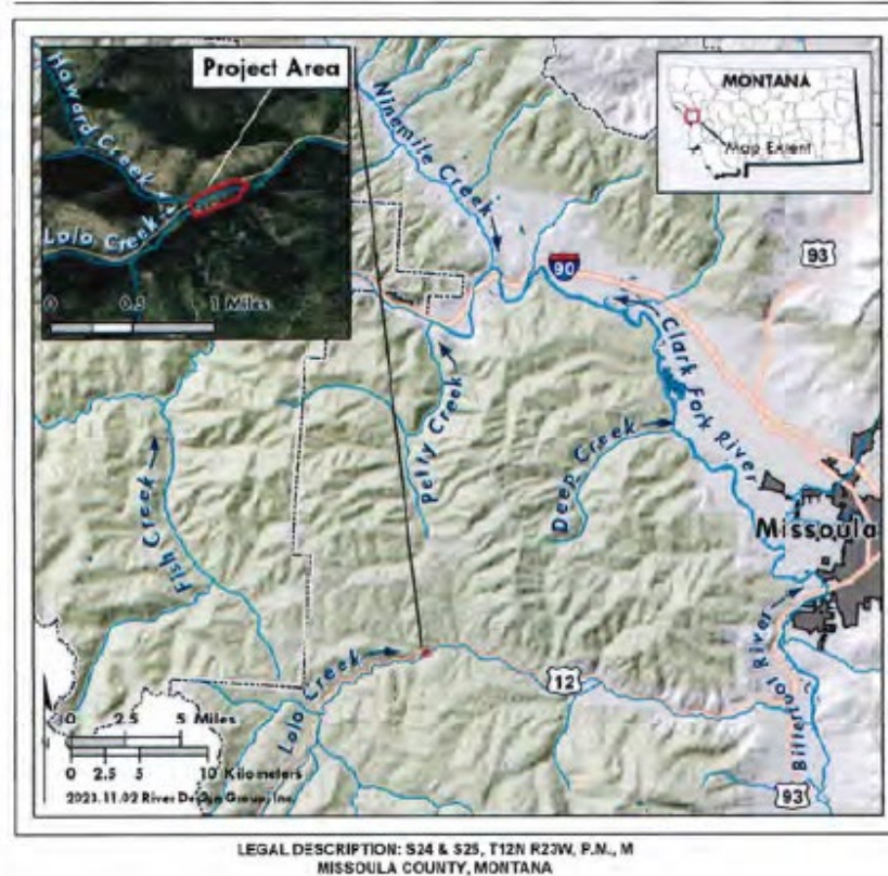
Figure 1. Location Overview