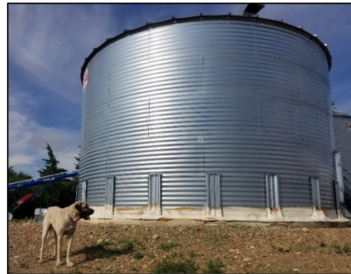
Figure 3: Livestock guard dog deployed at farm with grain spills to test its deterrence efficacy.