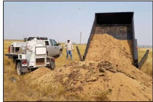
Figure 2: Thousands of pounds of spilled grain that we removed, then donated to neighbor for feed (was e-fenced).