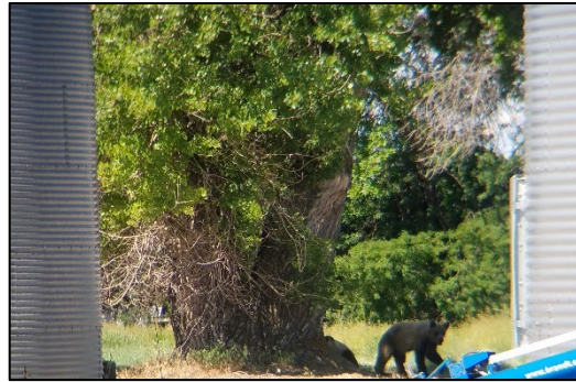
Figure 5: Two yearling grizzlies at unoccupied farm eating spilled grain.

Most of the livestock loss occurred on Dupuyer creek (Fig. 6). Bears caused property damage on; two grain bags, one haylage bag, two bird coops. For bears using unsecured food – twice each for birdseed and garbage, and three times for grain spills. There were no attacks this year, but one encounter – people bumped a bear at close range and it ran off. We received five complaints about bears near people without any attractant being acquired. We responded to all calls as quickly as possible, with most of our bear complaint responses occurring within 30 minutes.