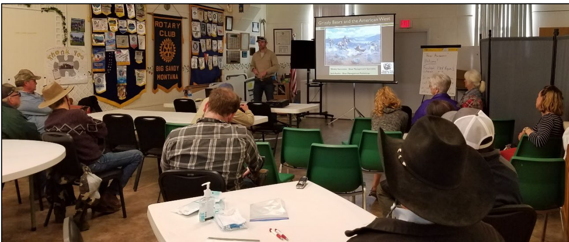
Figure 1: Public meeting and safety training in the town of Big Sandy, following observations of grizzlies in the area.

The 2021 work season differed from past efforts because FWP administrative Region 4 was not divided into two separate grizzly bear management districts. This year, both bear managers shared the entire region, with whoever closest and available responding to bear calls. Thus, these summary statistics don't necessarily provide the whole representation of bear management efforts across the region, but instead reflect the work coordinated by the Conrad field office. Grizzly bears in the area remain federally protected via the Endangered Species Act, thus final management authority is under the United States Fish and Wildlife Service.