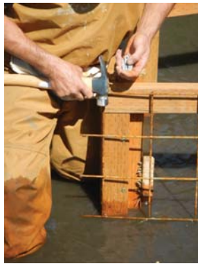
Cut fencing so a metal runs along the top and outside edges, with 6" stakes on bottom for anchors.

Attention to detail, such as making sure posts and braces are level and straight will ensure the structure is more durable.