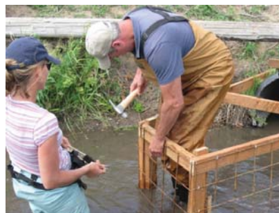
Install front wire panel on the filter frame. Cut a hole that will fit tightly around the pipe.