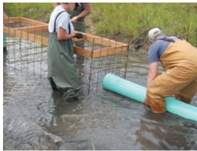
Place filter and insert PVC or double-walled poly pipe. Note: drill two holes in top of pipe to attach pipe to fencing.