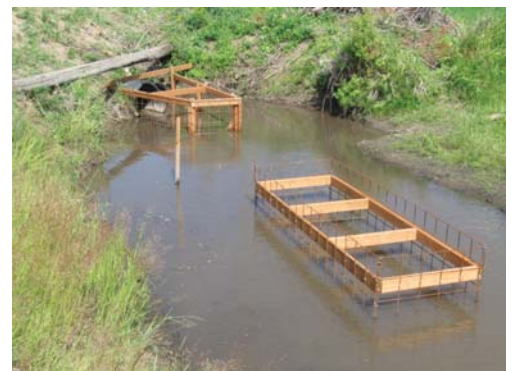
Inspect filter boxes for any gaps or holes.