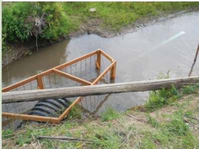
Place pipe into stream with one end running two feet into the filter frame.