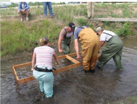
Anchor filter box by embedding the 6-inch wires on the bottom of the filter into the streambed.