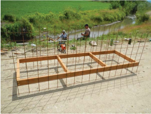
Construct a rectangle of appropriate size and at equal intervals install cross braces. (In this photo the filter is upside down during construction.)