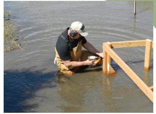
Block vertical posts flush with extensions.