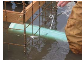
Attach PVC pipe to filter box using aluminum rod.