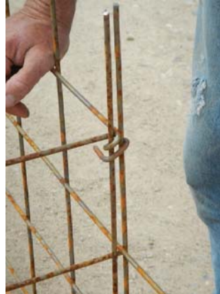
Attach walls together by twisting prongs using pipe nipples.