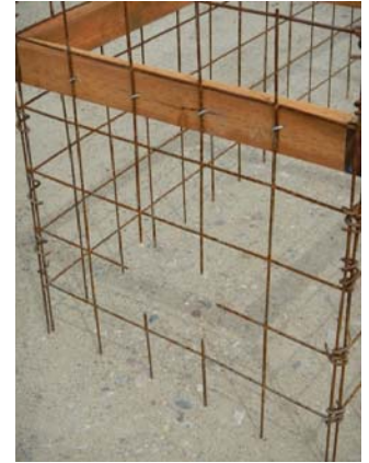
Cut a hole in the wire large enough to insert the PVC pipe.