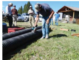
If using double-walled corrugated pipe, prepare pipe by cutting slits of outer layer to allow air to escape.