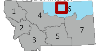
Area of Interest