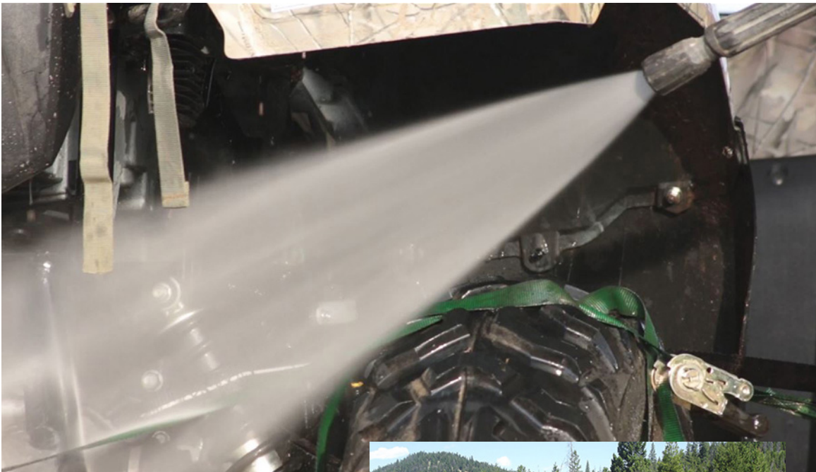
Thoroughly wash the vehicle, especially areas that hold mud with seed and debris. Longer wash times are more effective for removing weed seed.