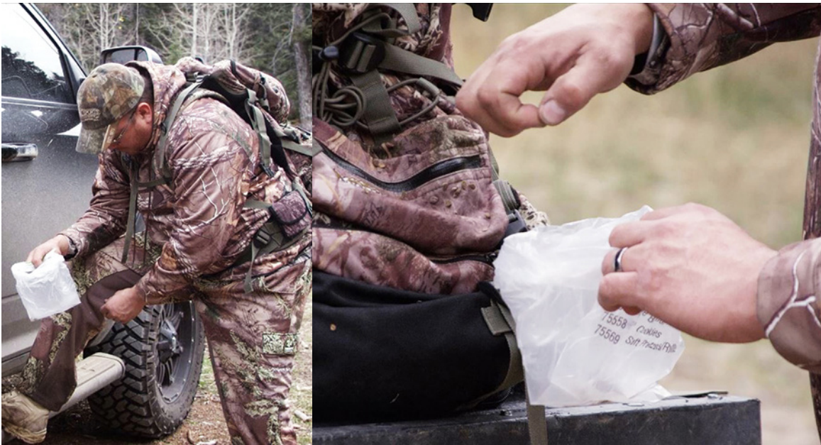
Remove weed seed from clothing and gear, bag the seed, and properly dispose of it to prevent spread.