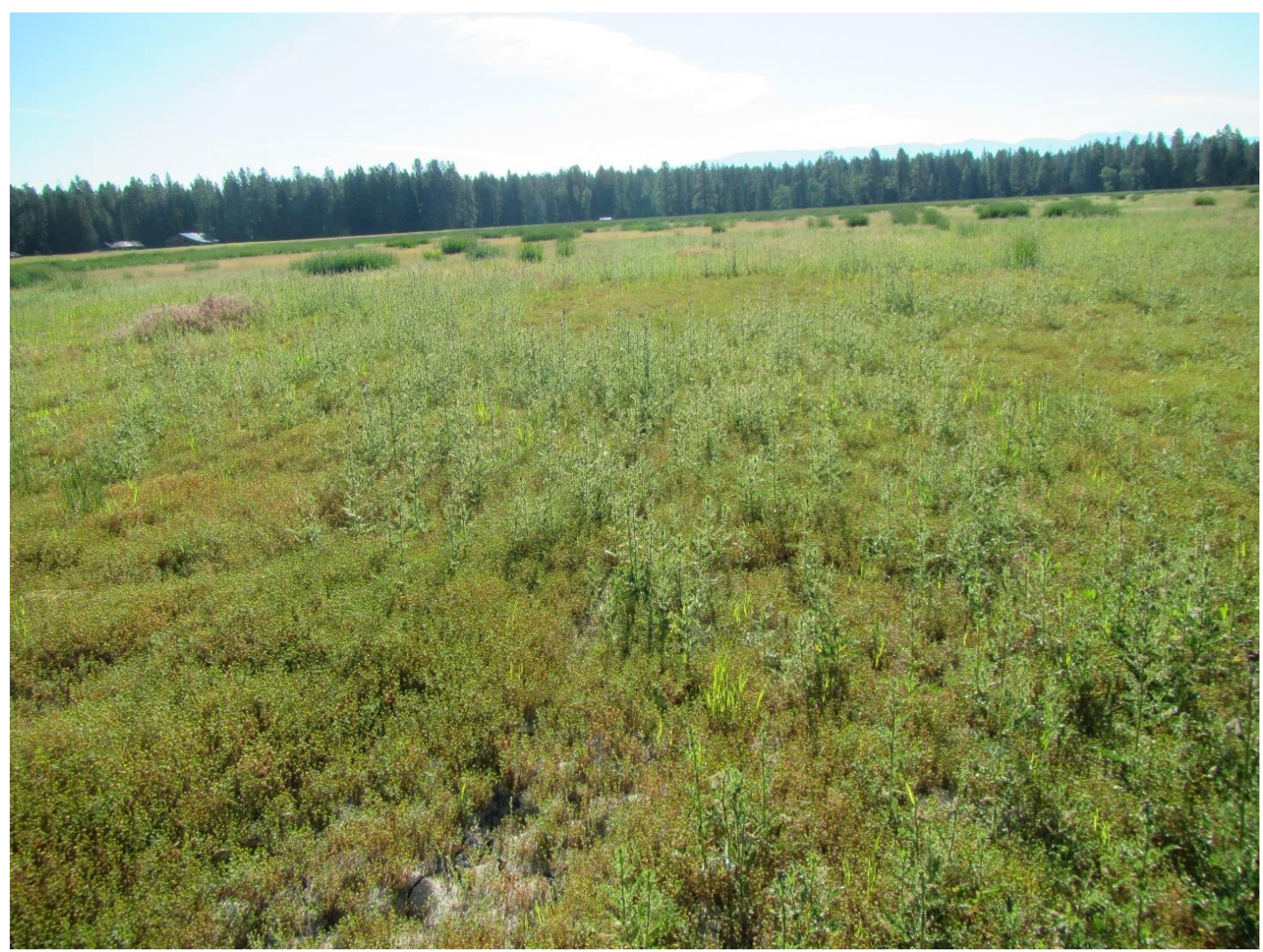
Figure 1: This 50-acre field has been idle since tillage in spring of 2015. Ground was uneven, with Canada thistle, pineapple weed, quackgrass, and bare ground dominating. In spring and summer, 2019, FWP contracted site preparation, spraying and tillage, to prepare the site for a fall planting.

The proposed action would involve 50-acres of prepared ground planted into winter wheat, demonstrate suitability of agriculture soils, return former fields to productivity, enhance soil health, and improve weed control. This is a no-cost action that would improve FWP's long-term management options for the property, ultimately enhancing effective wildlife habitat, improving hunting opportunities, and reducing weed control expenses. By demonstrating the site's agricultural potential, FWP may be better able to attract interested growers for a multi-year lease and negotiate terms that would benefit wildlife and the long-term management of the property.