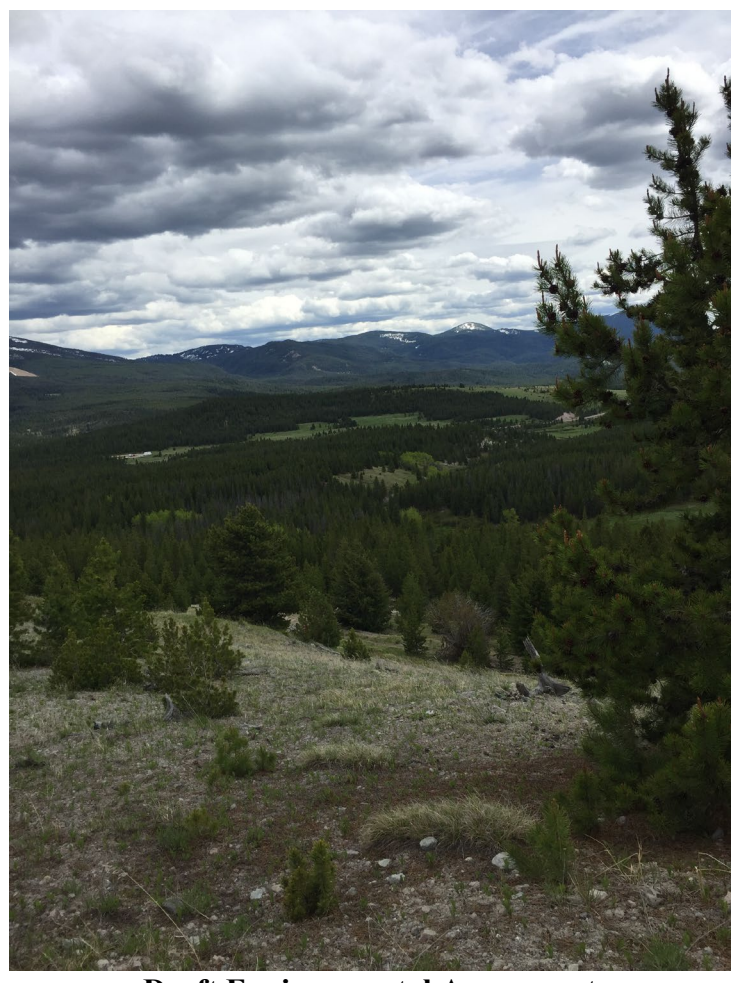
Draft Environmental Assessment For Grassy Mtn Addition Fee Title Acquisition December 3, 2019