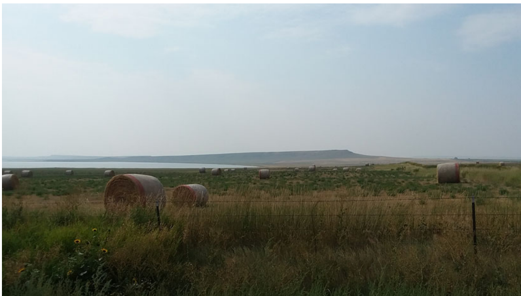
8-15-18. Photo depicting baled hay within are area targeted for haying on Big Lake WMA.

Hay cutting would benefit wildlife, specifically waterfowl, upland birds, and nongame species by maintaining upland habitat productivity. Periodically cutting select portions of these upland cover patches would create a diverse habitat age structure within the WMA. Grass litter would not be allowed to build up, extending long term productivity. Periodic haying would also increase the functional life of broadleaf species in these cover plots, such as alfalfa. The hayed areas would provide temporary foraging areas for upland bird chicks. After haying, second growth alfalfa would also provide a late summer forage source for mule deer and pronghorn.