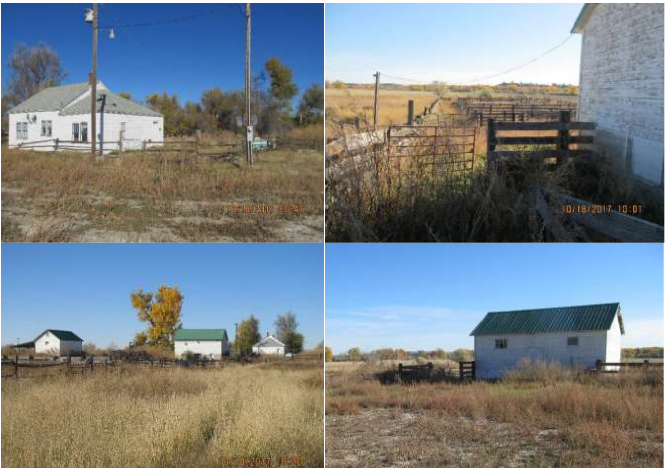
Figure 1. (a) House to be removed. (b) corrals surrounding house to be removed. (c) view of homestead. (d) building one to be removed.

FWP proposes development of two new gravel parking areas and replacement of two existing culverts (Figure 5) on the WMA along Highway 47. Each parking area will accommodate approximately 6 vehicles. The development and improvement of this site would enhance the functionality of the WMA while facilitating public recreational opportunities. The funding for this proposed project would be derived from the 2013 Habitat Montana spending authorization.