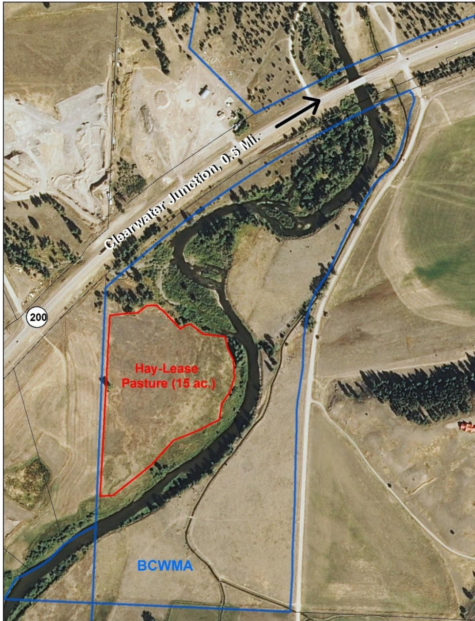
Figure 1. FWP-owned hay pasture that would be subject to the proposed BCWMA-Vannoy Ranch Cooperative Habitat Management Agreement.