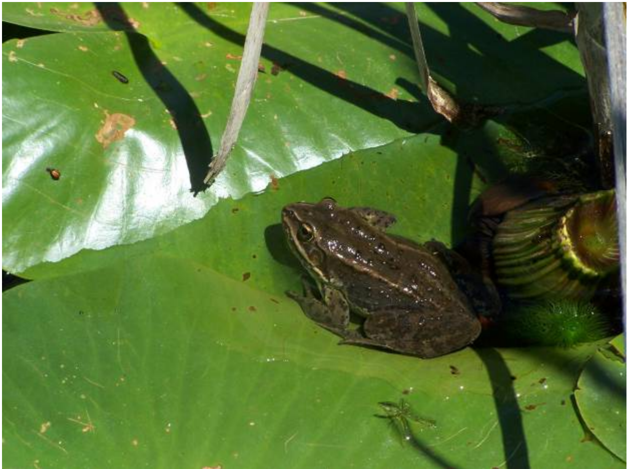
Columbian Spotted Frog