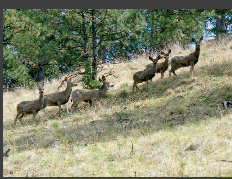
Wildlife managers enter scientific information into mathematical equations that "model" different versions of mule deer and other wildlife populations. This helps FWP figure out, among other things, the best management response when there are too many or too few animals in populations.

Because they are composed of scientific data like yearly harvest survey reports, population models often reduce the uncertainty of