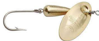
single pointed hook on a spinner (Panther Martin® shown)