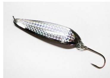
single pointed barbless hook on a lure (Crocodile® Casting Spoon shown)