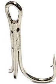
Treble hook cut to make single pointed hook