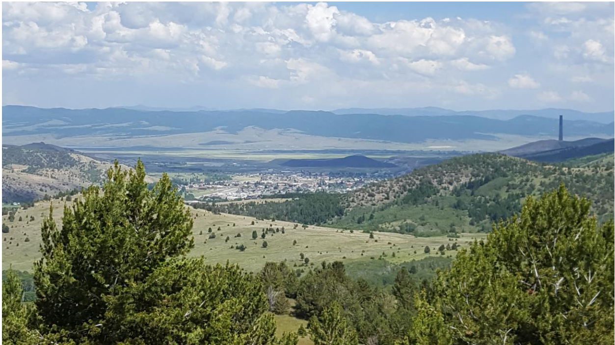
Anaconda and The Anaconda Smoke Stack seen from Garrity Mountain WMA