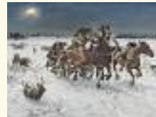
For centuries Europeans feared wolves. “Wolves Chasing Sleigh” was a popular subject for painters.