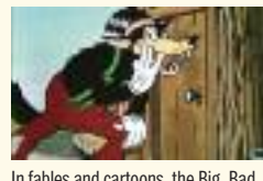
In fables and cartoons, the Big, Bad Wolf uses cunning and deceit to trick Little Red Riding Hood, the Three Little Pigs, and other innocents.