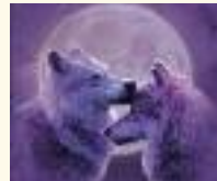
Modern fans embrace the wolf as intelligent, sensitive beings restored to their rightful place.