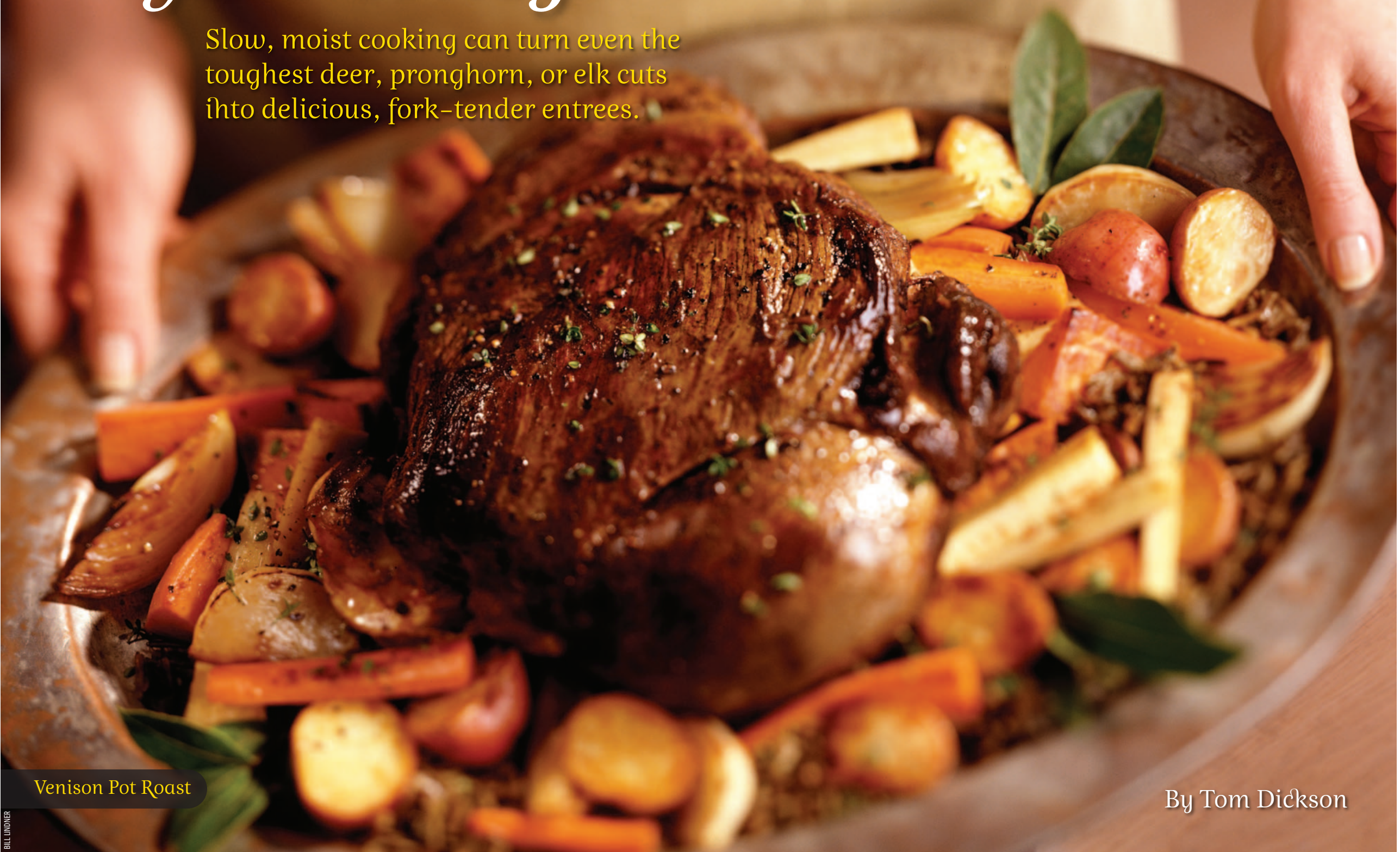
Venison Pot Roast

Slow, moist cooking can turn even the toughest deer, pronghorn, or elk cuts into delicious, fork-tender entrees.