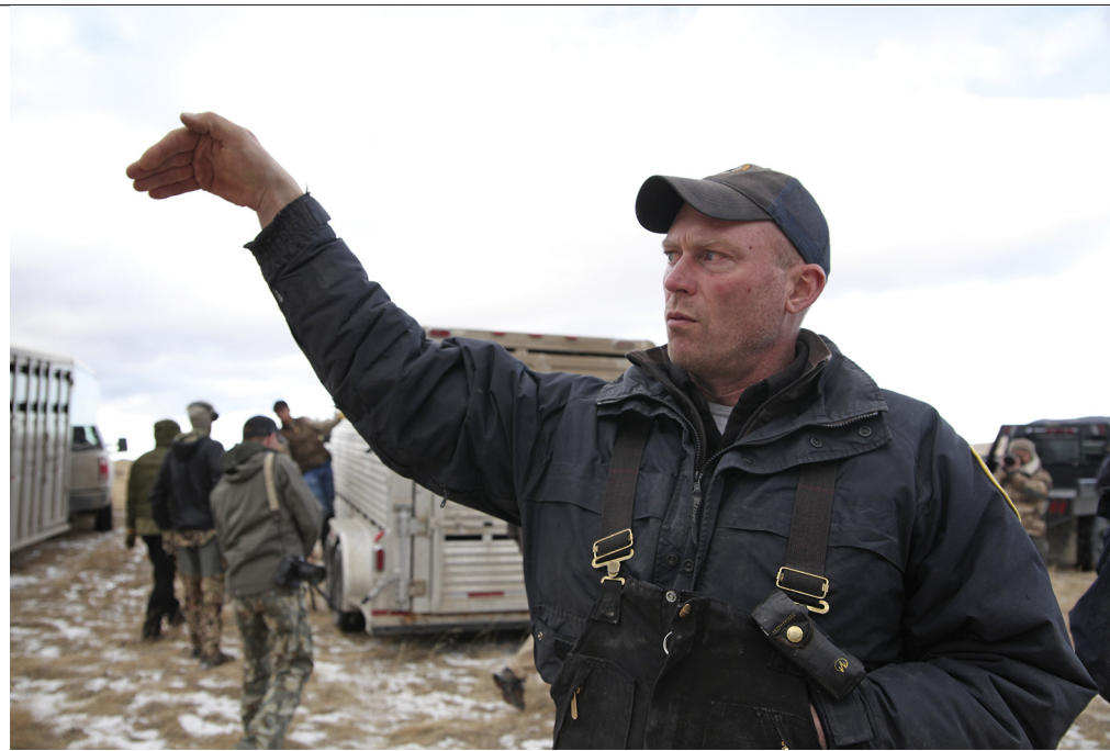
Bighorns were likely here for a very long time.

FWP trapped and relocated bighorns for decades, beginning in 1939 with herds from the steep cliffs above the Sun River,