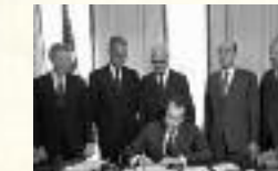
On December 28, 1973, President Richard Nixon signs the Endangered Species Act into law.

Endangered Species Act requires states to develop plans and pay for recovering listed species. Currently Montana has 17 species listed as federally threatened or endangered. Little funding is provided to states for this important work.