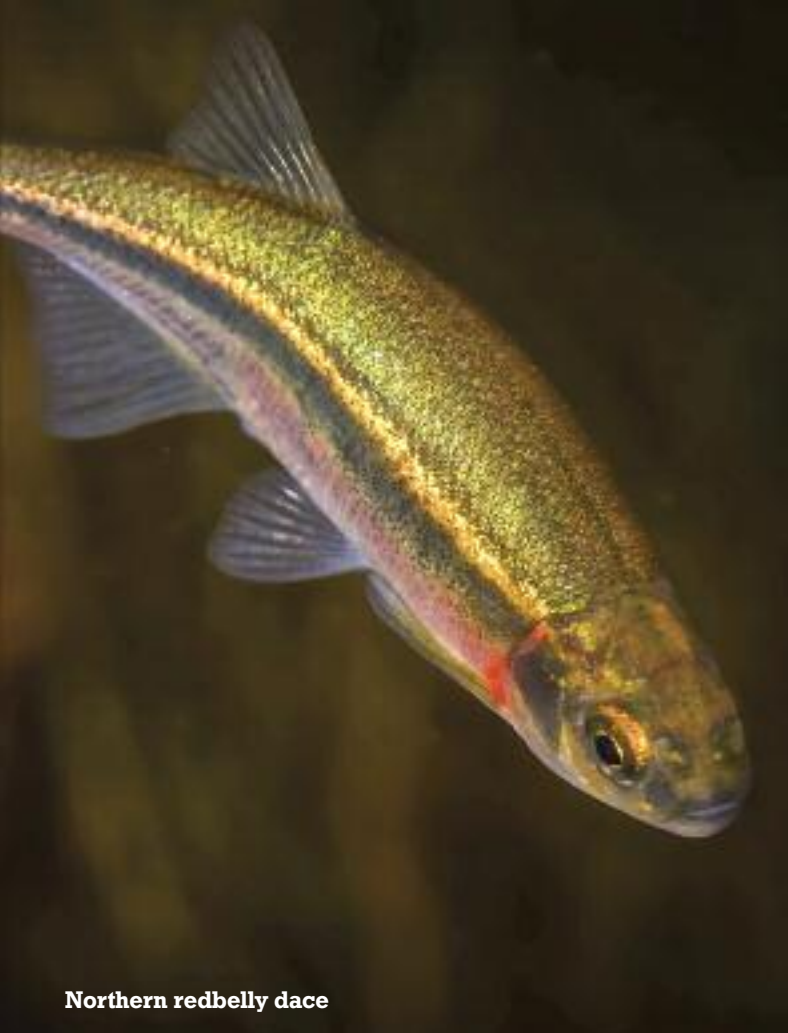
Northern redbelly dace