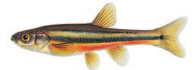
Northern redbelly dace Phoxinus eos