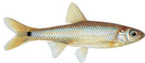
Spottail shiner Notropis hudsonius

"If you didn't have minnows, you wouldn't have game fish. They are like what grass and forbs are to elk and deer."