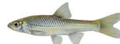
Sand shiner Notropis stramineus