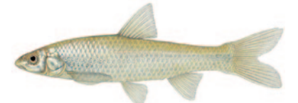
Western silvery minnow Hybognathus argyritis