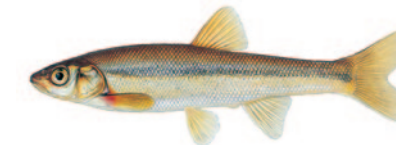
Lake chub Coeusius plumbeus