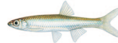
Emerald shiner Notropis atherinoides