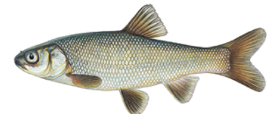
Utah chub Gila atraria