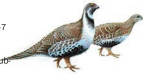
Native species of concern

Wingshooting appeal: The largest grouse in North America. A remnant of earlier times when the species was far more abundant in the West. Montana has some of the nation's largest huntable populations.